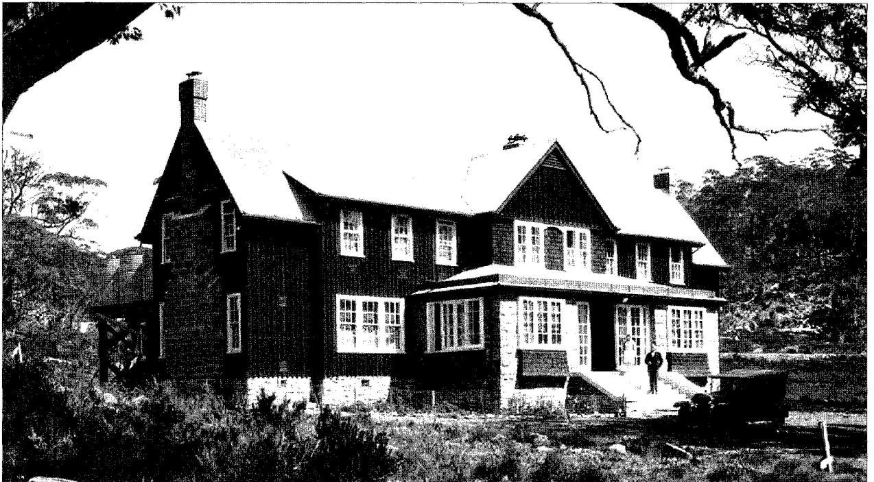
PLATE 2 The Rainbow Chalet.

After a few years at Lake Leake the family moved to Interlaken, located on the shore of Lake Sorell. Here the fishing was again superb, the lakes were not overfished;