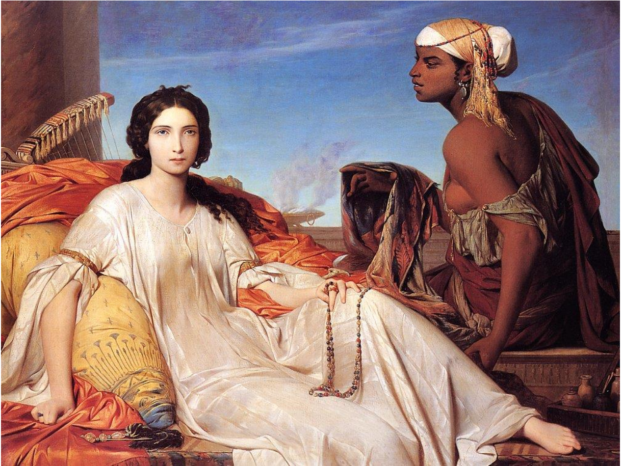
Fig. 4: Odalisque or Esther , François-Léon Benouville, 1844, oil on canvas, Musée des Beaux-Arts, Pau.