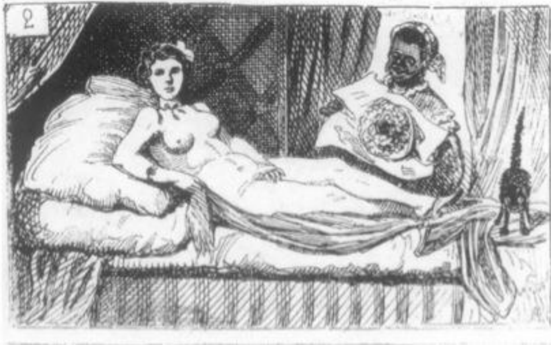
Figs. 2: Counterclockwise: caricatures of Olympia by Cham (in Le Salon , June 2, 1865), Bertall (in Journal Amusant , May 27, 1865), and G. Randon (in Le Journal , June 29, 1865).