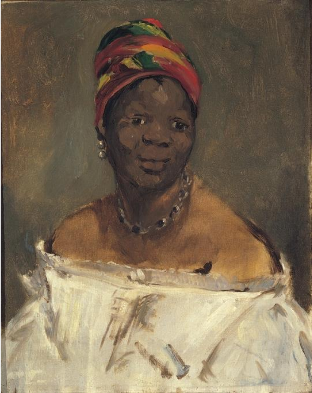
Fig. 7: Portrait of Laure or La Nègresse , Édouard Manet, 1862-1863, oil on canvas, 24 x 19.7 in., Pinacoteca Giovanni e Marella Agnelli, Turin.

Image source: http://pinacoteca-agnelli.it/visit/wp-content/uploads/2012/07/Manet.jpg