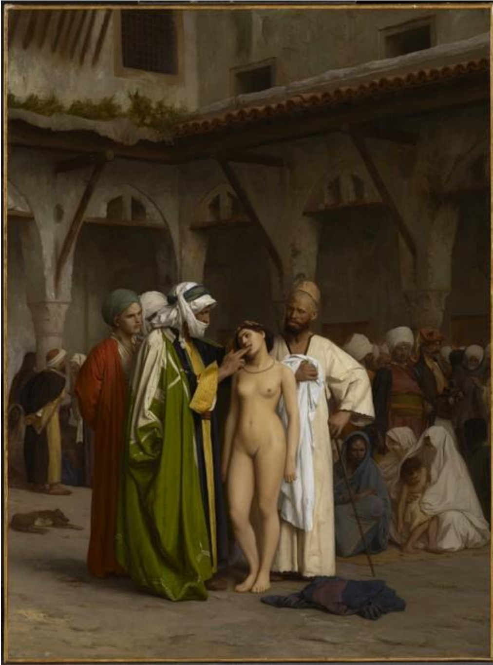
Fig. 3: Le Marché aux esclaves or The Slave Market , Jean-Léon Gerôme, 1866, oil on canvas, 33 5/16 x 24 15/16 in., Clark Art Institute