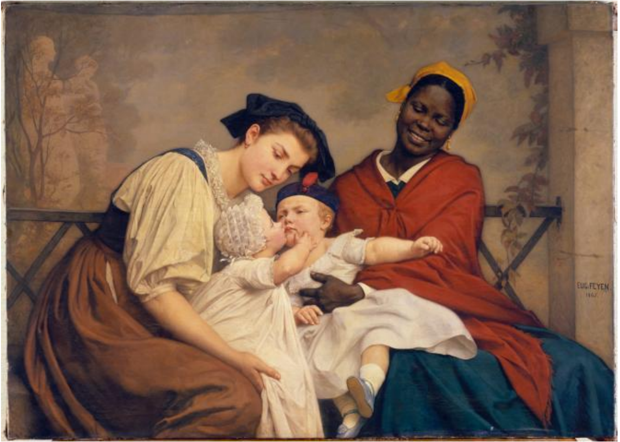
Fig. 5: Le basier enfantin or The Childlike Kiss , Jacques-Eugène Feytaud, 1865, oil on canvas, 43 5/16 x 59 13/16 in., Palais des Beaux-Arts, Lille.