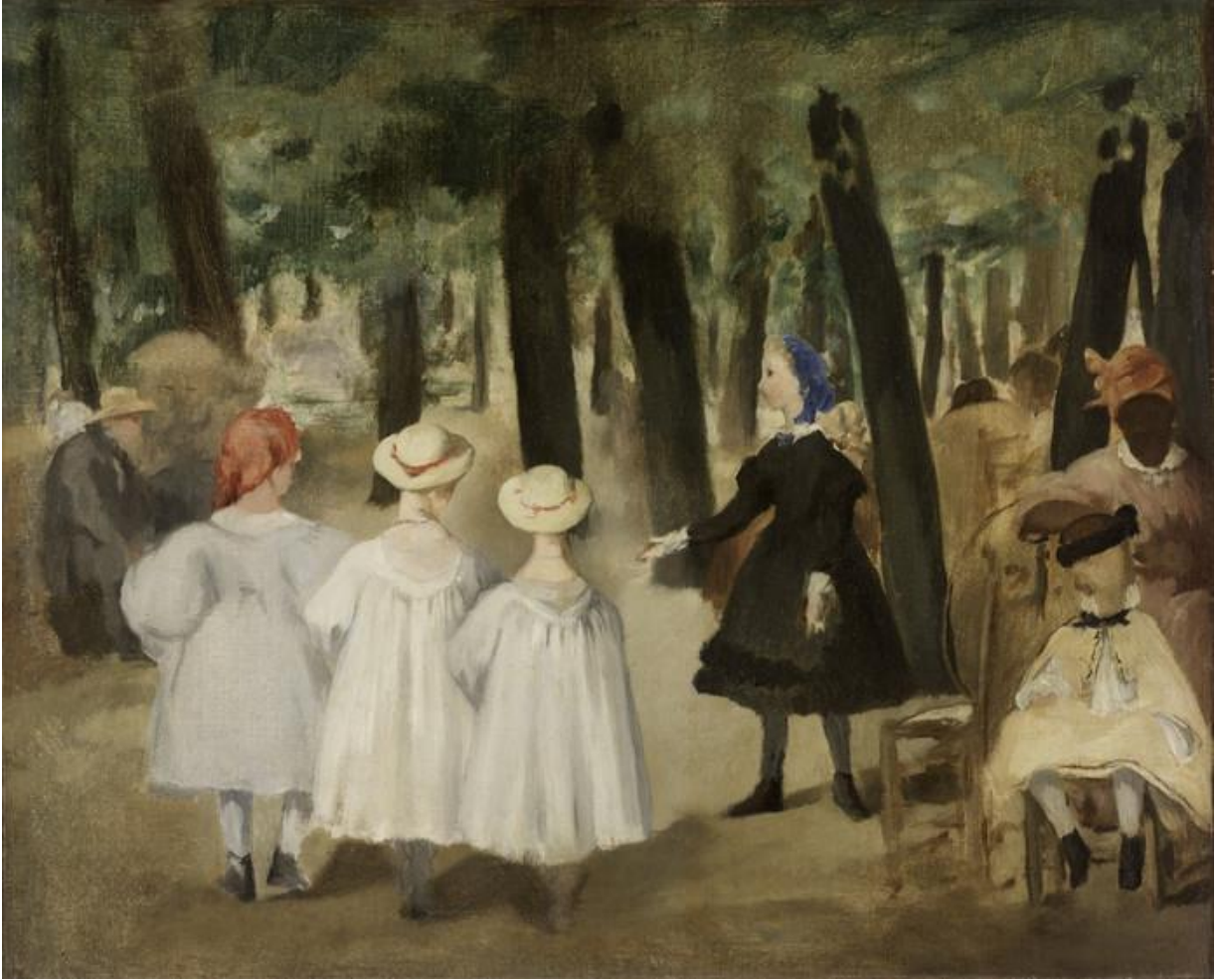
Fig. 6: Children in the Tuileries Gardens, Édouard Manet, ca. 1861-1862, oil on canvas, 14 7/8 x 18 1/8 in., The Rhode Island School of Design Museum.