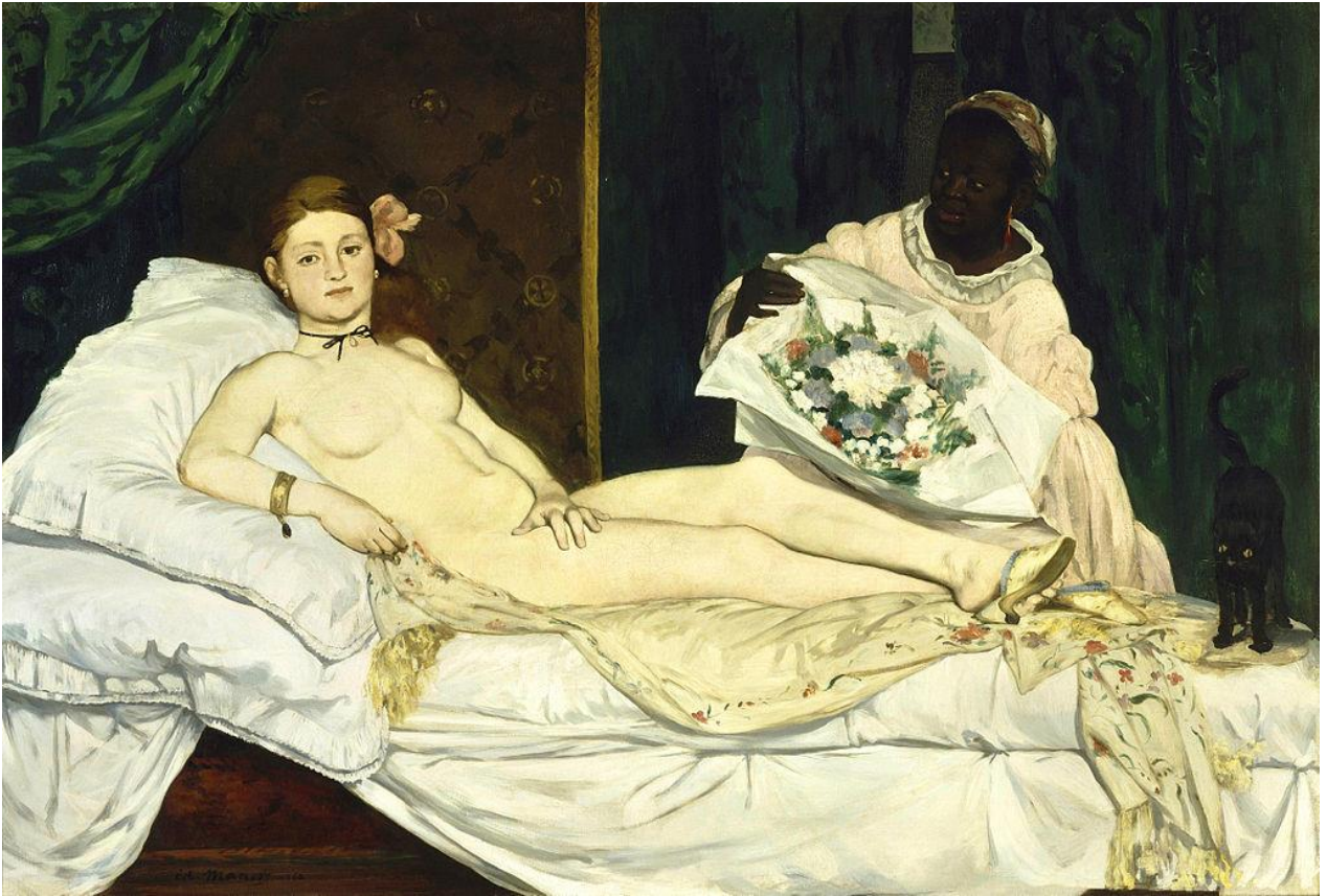
Fig. 1: Olympia , Édouard Manet, 1863, oil on canvas, 51.4 x 74.8 in., Musée d'Orsay, Paris.