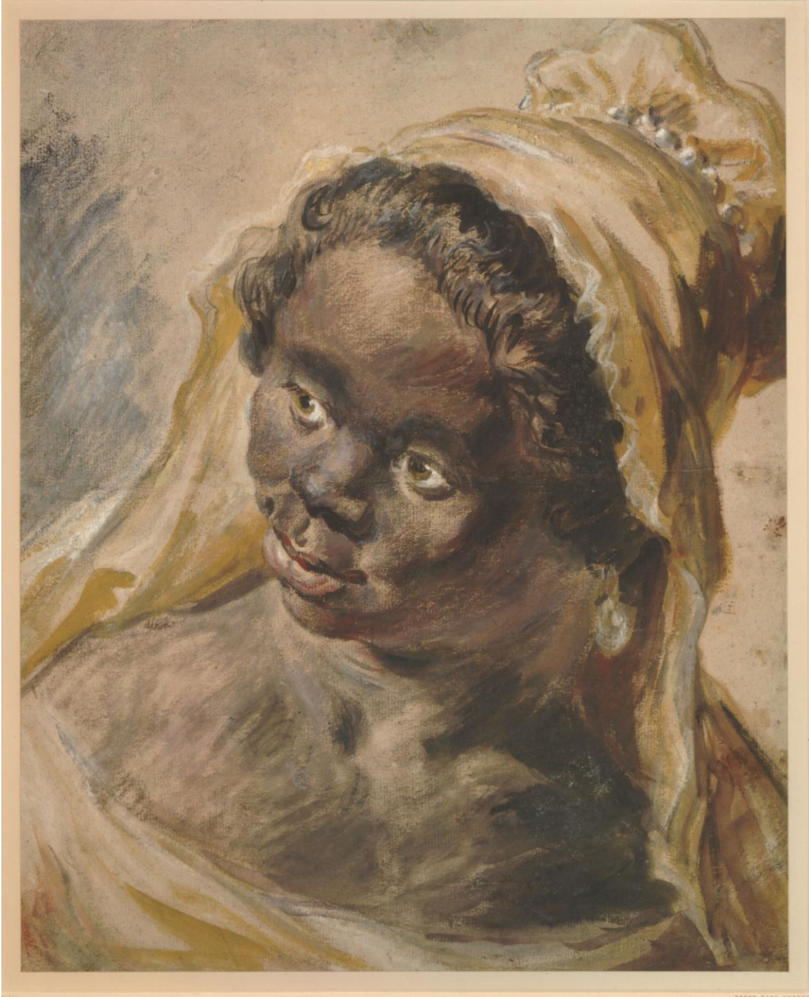
Fig. 8: Head and shoulders of a black woman , Circle/School of Peter Paul Rubens, ca. 1592-1640, bodycolor heightened with white over black chalk on paper, 19 1/16 x 15 3/8 in., The British Museum.

Image source: http://www.britishmuseum.org/research/collection_online/collection_object_details.aspx?objectId=709256&partId=1&searchText=rubens&images=true&from=ad&fromDate=1592&to=ad&toDate=1640&page=1