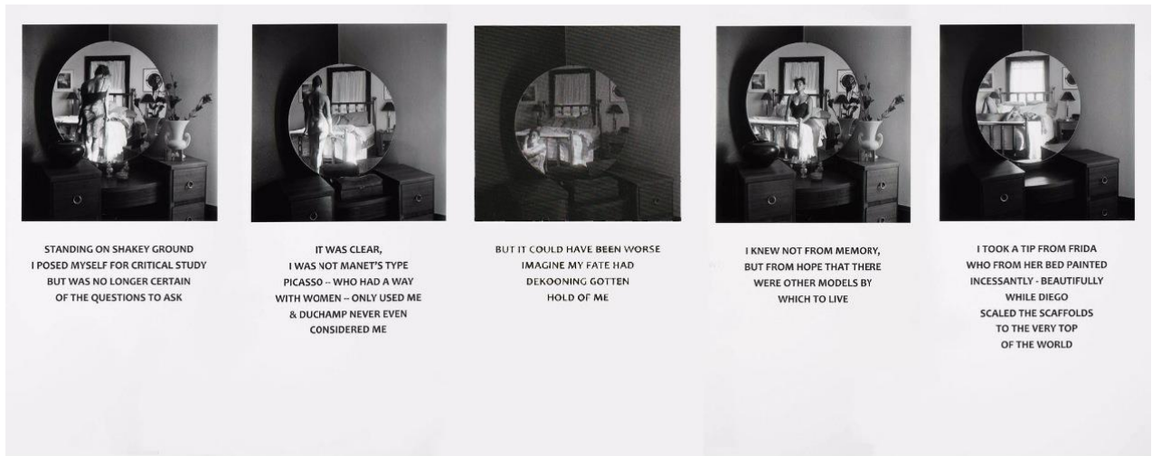
Fig. 11: Not Manet's Type , Carrie Mae Weems, 1997, five pigment ink prints, 30 x 18 in. each, Courtesy of the artist and Jack Shainman Gallery, New York.

Image source: Kathryn E. Delmez, ed, Carrie Mae Weems: Three Decades of Photography and Video (Nashville: Frist Center for the Visual Arts, 2012), 161-163, and https://www.artsy.net/artwork/carrie-mae-weems-not-manets-type . Note: I have photoshopped this image in order to reflect the series in the above catalogue, solely for the purposes of reproducing the order of the version of the series I discuss.