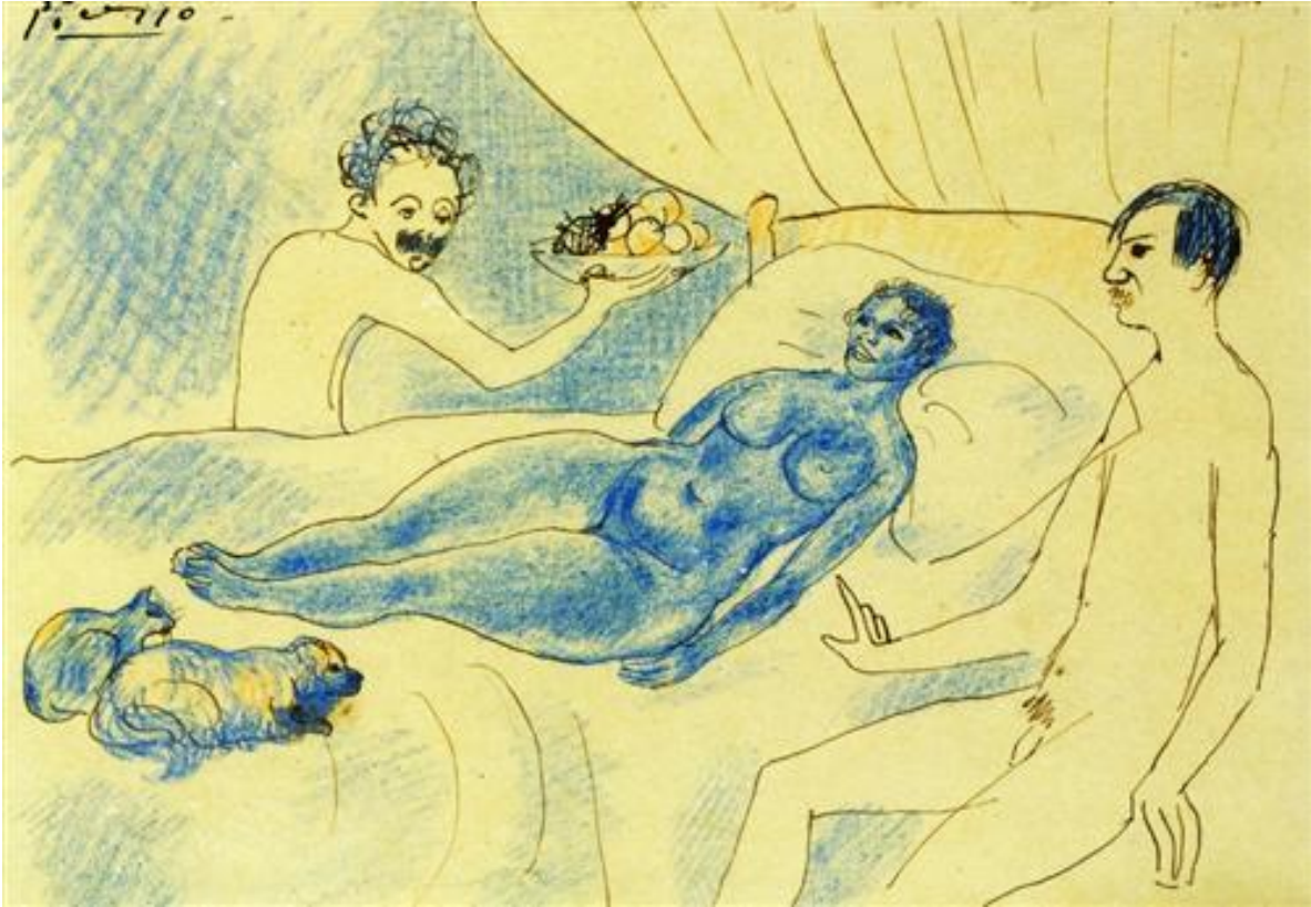
Fig. 9: Olympia , Pablo Picasso, c. 1902, ink and chalk on paper, 6 x 8 13/16 in., Private collection.