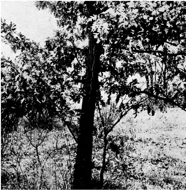
Fig. 3. — Sl. 3.