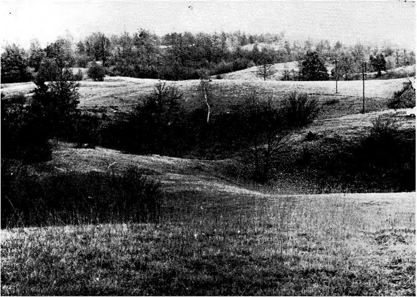
Fig. 2. — Sl. 2.