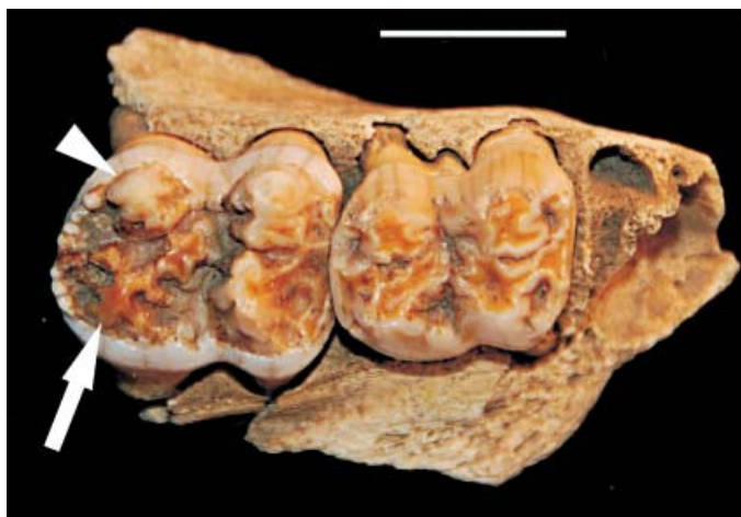
Fig. 2. The same case as in Fig. 1. View from the occlusal aspect. Arrow head: plane-form enamel defects of the cusps of the M 1 . Arrow: missing enamel of the disto-palatinal cusp. Scale: 1 cm.