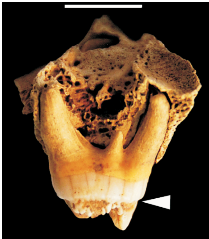
Fig. 4. The same case as in Fig. 1. View on M 1 from the distal aspect. Arrow head: end of the plane-form enamel defect. Scale: 1 cm.

The enamel defect described here (Fig. 1-5), may be classified as a typical plane-form defect (cf. HILLSON 2014, 167-170). The cervical ledge indicates the resumption of normal activity of the secretory ameloblasts.