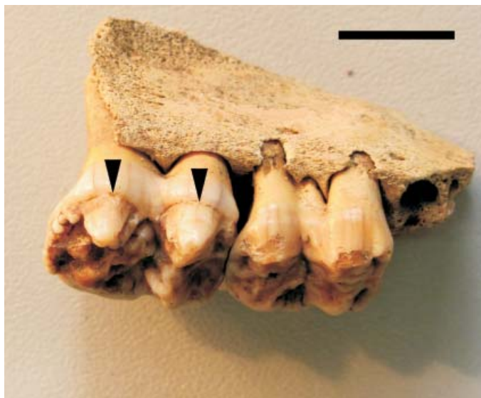
Fig. 1. Vyšehrad, 10 th /11 th cent. A.D. (Inv.-No. 21). Domestic pig, right maxilla fragment with severe plane-form enamel defects of the cusps of the right upper M 1 (arrows). View from the lateral aspect. Scale: 1 cm.