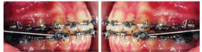
Figure 5. SUS 2 (Sabbagh Universal Spring 2).

At the same time of SUS 2 action, three elastics have been applied in anterior position (Figure 6):