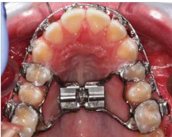
Figure 4. RPE (Rapid Palatal Expander) installed

Then the patient was fitted with upper and lower orthodontic fixed appliances and progressed rapidly (0.014 Ni-Ti, 0.016 stainless steel, 0.019x0.025 stainless steel) to fit the SUS 2 and use the potential residual growth. The SUS 2 has been maintained for seven months to achieve a sagittal hypercorrection. (Figure 5)