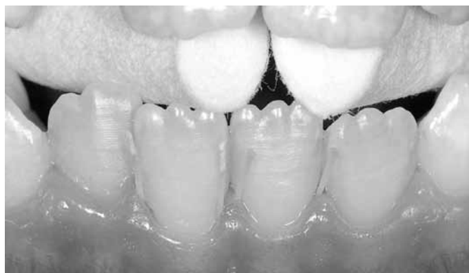
Figure 1. The gingival crevicular fluid collection. Four samplings were performed at the mesial and distal aspects of each of the mandibular central incisors by using endodontic #25 standardized sterile paper strips.

(mesial, distal, medio-buccal and medio-palatal/lingual), as previously described. 10 Briefly, the presence of supragingival plaque (PL+), the gingival bleeding within 15 sec. after probing (BOP+), and the probing depth (PD) were recorded. A single expert examiner collected the clinical data in all subjects. Contamination of the GCF was minimized by recording the PL+ before carefully cleaning the tooth with a sterile curette, then by collecting GCF and subgingival plaque from the isolated area, and finally by recording the PD and BOP+. The GCF collection was performed at both the mesial and distal sites on each of the lower central incisors as previously described. 10,11 Briefly, endodontic #25 standardized sterile paper strips (Inline; Torino, Italy) were inserted 1mm into the gingival crevice and left in situ for 60 sec. (Figure 1). These four samples were pooled, were transferred to plastic vials and immediately stored at -80°C, until analyzed.