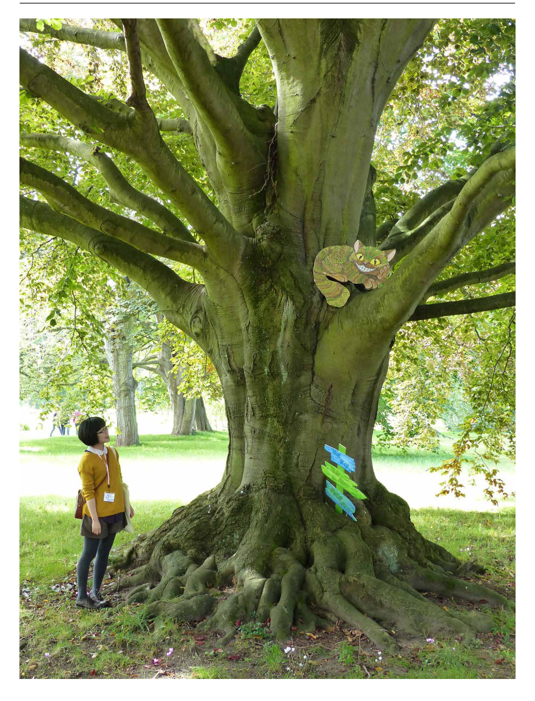
"The Cat only grinned when it saw Alice" at the Cambridge 2015 conference Alice Through the Ages .