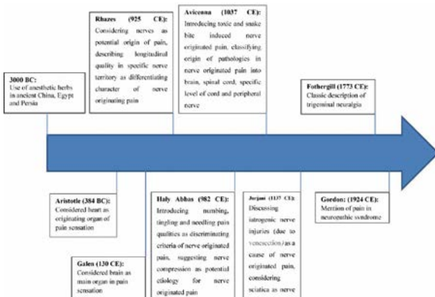
Figure 2. Time table of historical findings on the concept of neuropathic pain