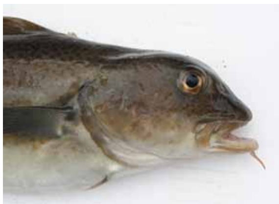
Fig. 2. Abnormal specimen of Gadus morhua 501 mm TL with pug-headedness showing right side of the head.

To evaluate the level of the damage in the skull of the abnormal pug-headed specimen, the osteological features were compared with those of normal specimens. Internally, the vomer, parasphenoid, and maxillaries were shortened, and displacement and/or curvature of the nasals,