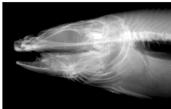
Fig. 3. X-ray of the right side of the head of normal specimen of Gadus morhua , 468 mm TL.

frontals, vomer, and palatines were observed. Some of the teeth in the upper jaw were curved backward and others curved forward instead of being projected downward. For these reasons, the forehead was upraised and steep in the pug-headed specimen (Figs. 3, 4).