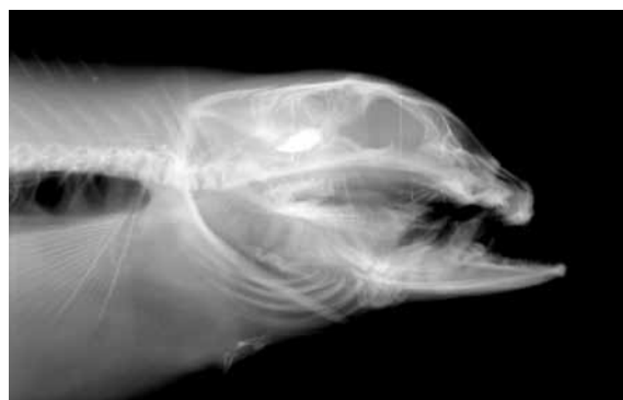
Fig. 4. X-ray of the left side of the head of abnormal specimen of Gadus morhua , 501 mm TL. With pug-headedness.