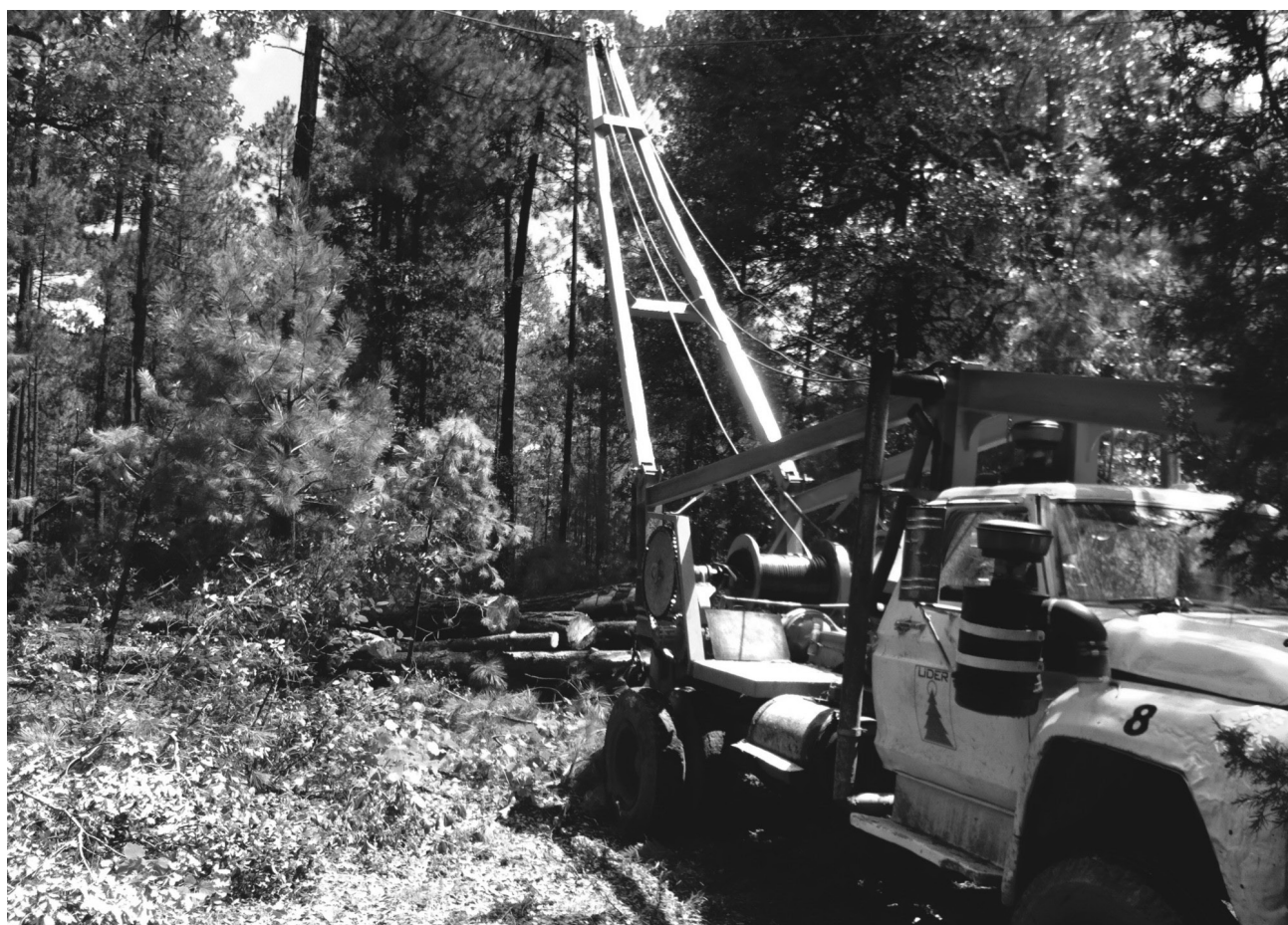
Fig. 1 Jammer with one reel, which is the type commonly used in timber harvesting operations in Mexico

reverse the balance of the initially perceived benefits in the medium and long term (López 2009).