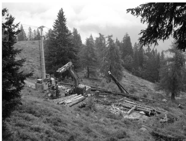
Fig. 2 Representative cable logging operation

This study focuses on cable logging (Fig. 2), which is the backbone of steep slope harvesting world-wide (Bont and Heinimann 2012). In 2012, there were over 350 cable logging contractors in alpine Italy alone (Spinelli et al. 2013). On steep terrain, cable logging is the cost effective alternative to building an extensive network of skidding trails and results in a much lower site impact compared to ground based logging (Spinelli et al. 2010). On the other hand, cable logging is inherently expensive because it is normally de-