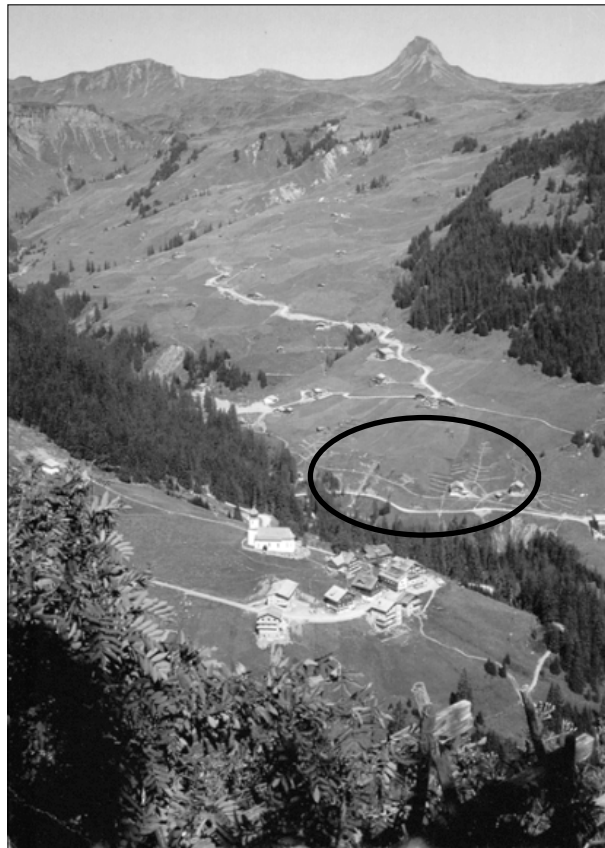
Figure 5: Picture Postcard of drainage at the Damüls road close to »Berghotel Madlener«, (sent July 9th, 1969) Publisher Foto Branz, Lustenau. With permission of Vorarlberger Landesbibliothek.

Road construction to Damüls reveals how »nature« was »targeted and transformed by the twin pressures of science and capital« 91 but, following Prudham, it can also be considered as a »response to new opportunities and constraints from a dialectical conversation between social and environmental change.« 92 Road construction plans for Damüls had existed as early as the beginning of the 20 th century. The knowledge- and capital-demanding Alpine topography and hydrology had thwarted realization of the plans. Although national socialist regional development programs envisioned high-flying plans for peripheral villages, they failed in terms of road building in Damüls. 93 The so-called 1950s syndrome,