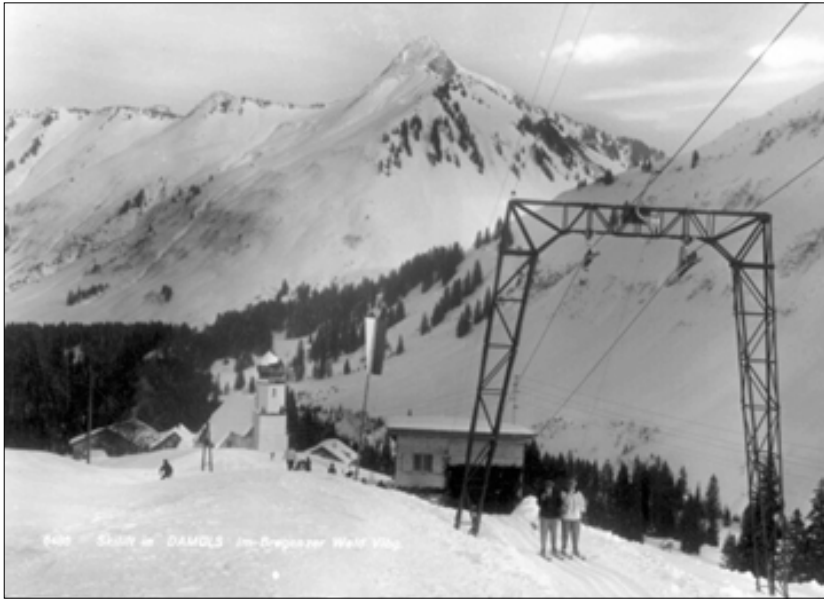
Figure 6: Picture postcard »Schlepplift 1800«, Publisher Foto Risch-Lau. With permission of Vorarlberger Landesbibliothek.

building ground for a weekend cottage. Close to the church, he found a plot owned by the association of alpine meadow users, »Alpgemeinschaft Oberdamüls«. The association agreed to sell the property under the condition that Lingenhölle would run the T-bar lift. 101 Soon, a second T-Bar lift was added to the enterprise. 102 Both T-bar lifts were replaced by a state-of-the-art T-bar lift called »Höhe 1800« (denoting its height of 1800 meters) in 1957. This lift was a major tourist attraction in Damüls for years. Images of it were widely distributed by picture postcards and tourism advertising brochures. Figure 6 is a typical example depicting the T-bar lift »Höhe 1800«: