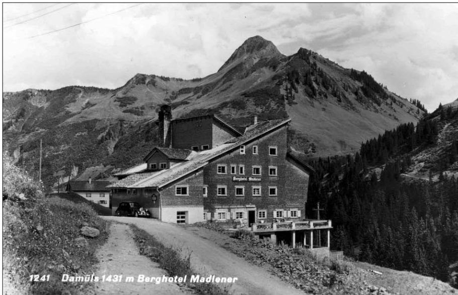
Figure 4: Picture postcard »Damüls 1431m. Berghotel Madlener.« (sent September 25, 1954), Publisher Foto Risch-Lau. With permission of Vorarlberger Landesbibliothek.

1928, »Berghotel Madlener« and guesthouse »Sonnenheim« followed in 1932 and »Gasthof Walisgaden« was opened in 1938. Damüls provided 300 beds in 1933, of which roughly one third was located in farmhouses. In the season 1932/33, the village counted about 10.000 overnight stays. 80 percent of those were German guests, who stayed on averages up to six days. 66 Damüls found itself in the midst of tourism-driven modernization in the beginning of the 1930s. Modernity was expressed vividly by the architecture of »Berghotel Madlener« depicted in Figure 4.