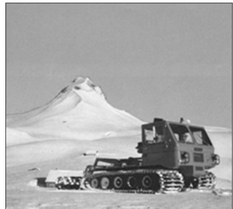
Figure 7: Snow groomer. Pistenraupe . In: Werbeprospekt »Damüls, die Sonnenterasse in Vorarlberg...« (ca. 1968), pub. by Verkehrsverein Damüls; in possession of Damüls – Faschina Tourismus, Kirchdorf 138, Damüls.

The snow groomer as advertising agent conveys images of modernity, safety and accessibility. Leisure skiing in Damüls was advertised to a paying, often urban audience with no previous experience of winter in the Alps. The image of the groomer in Figure 7 and others in which it figured prominently, suggested that ski lift operators mastered high alpine nature. It released skiing from topographical and snow cover uncertainties. Snow groomers and their com-