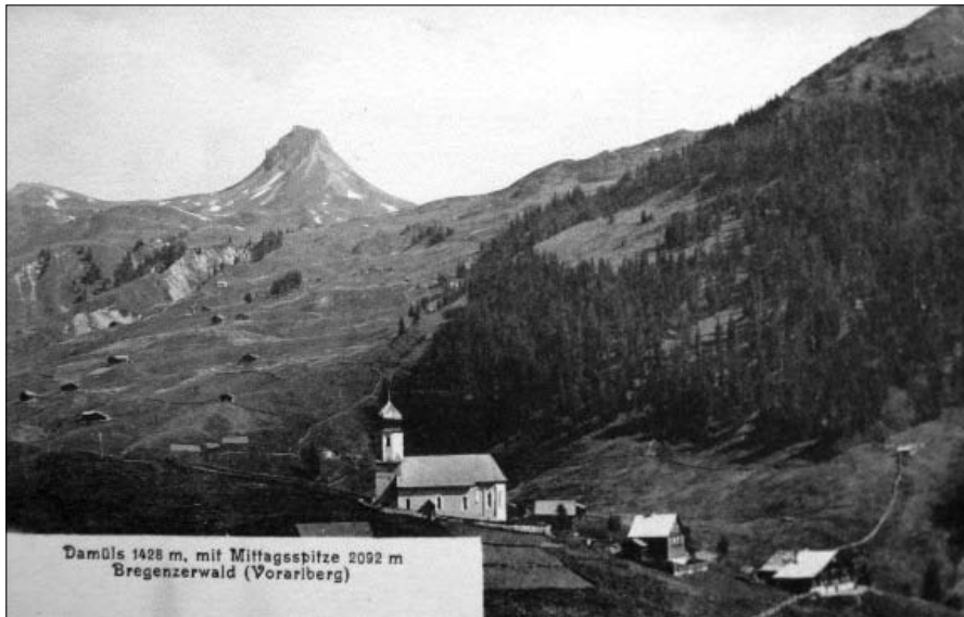
Figure 3: Picture postcard of Damüls church, the Alpe Uga and mountain peak »Mittagsspitze«. Publisher Herm. Steck, Feldkirch 1903.

all glaciers, mountain peaks, lakes, villages and valleys perceivable from the top of Damüls. As early as 1904, picture postcards depicting Damüls were produced. Figure 3 shows such a postcard portraying the village.