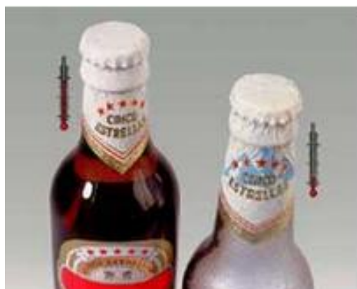
Fig. 2. Intelligent inks that change color with the temperature

Time- temperature indicators or integrators (TTIs) are designed to monitor, record and translate whether a certain food product is safe to be consumed, in terms of its temperature history. This is particularly important when food is stored in conditions other than the optimal ones. For instance, if a product is supposed to be frozen, a TTI can indicate whether it had been inadequately exposed to higher temperatures and the time of exposure. The communication is usually manifested by a color development (related to a temperature dependent migration of a dye through a porous material) or a color change (using a temperature dependent chemical reaction or physical change) (Fig. 2) Timestrip® has developed a system (iStrip) for chilled foods, based on gold nanoparticles, which is red at temperatures above freezing. Accidental freezing leads to irreversible agglomeration of the gold nanoparticles resulting in loss of the red color.