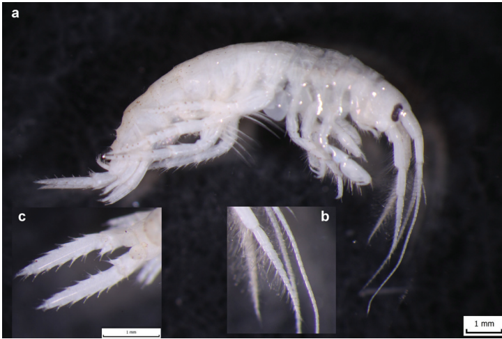
Fig. 1. a) Male specimen of Echinogammarus ischnus from the site Drava-Osijek sampled on 13 th February 2015; b) detail of flagellum of antenna with characteristic long, curly and abundant setation on second antenna; c) third uropods (U3) and telson viewed from above.

the easternmost border of Croatia with Serbia. Five alien amphipods, Dikerogammarus villosus , D. haemobaphes , D. bispinosus , Obesogammarus obesus and Chelicorophium curvispinum are known to be present in large rivers of Croatia, their distribution being established in a previous study (ŽGANEC et al., 2009).