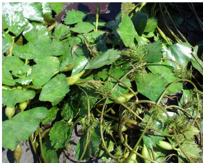
Figure 3. Trapa natans in the study area

T. natans is an invasive and highly expansive species within the biotope analyzed. The drastic increase in T. natans populations may result in root competition between this species and other macrophytes. The dense rosette of its floating leaves (Figure 3.) can shade out photosynthetic surfaces of indigenous macrophytes and, hence, reduce the rate of primary production of competing species. Although the effects of further propagation of the species on overall hydroecologic characteristics of the ecosystem are difficult to predict, certain preventive measures should be taken to limit its expansion. Mechanical removal of T. natans from parts of the lake most abundant in its populations is a realistically practicable operation. Potential expansion and effects of T. natans on the chemistry of the ecosystem and qualitative and quantitative structure of macrophyte communities of this ecosystem should be monitored, similarly to monitoring activities conducted in Bulgaria (Yocheva et al., 2013) or Croatia (Vukojević and Vitasović-Kosić, 2012)