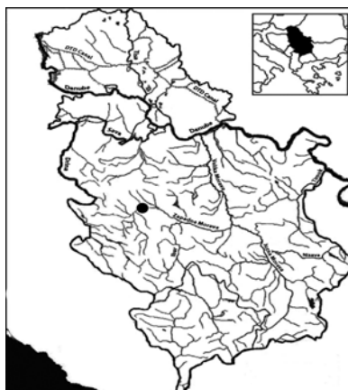
Figure 1. Location of the Međuvršje reservoir (Serbia)

The Međuvršje reservoir was created in 1953 by constructing a 31 m high concrete dam at 182 km downstream (Figure 1.).