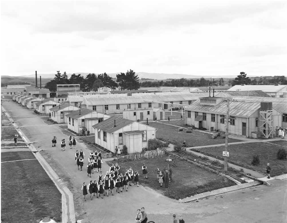
Fig. 2 View of the Polish children's camp, Pahiatua, New Zealand. Sl. 2. Pogled na poljski dječji kamp, Pahiatua, Novi Zeland.

Whilst the welcome in New Zealand was friendly, nonetheless the Polish children were transported to a camp, replete with barbed wire. As mentioned previously, this was envisaged as a temporary relocation prior to the children returning to Poland, so every effort was made to forge a community based on Polish tradition and protocol ( Fig. 2 ). Exchange and communication with New Zealand families was sporadic and generally confined to visits during school holidays. As the medium of instruction was Polish, opportunities to develop fluency in English were limited. Yet the resilience of the children, assisted by the nurturing of their teachers and caregivers, provided a strong patriotic bond that was to stand them in good stead for an uncertain future. Krystyna's Story traverses the entire journey through East Europe and Asia to New Zealand and is the only text to situate itself within the Camp and to encompass adulthood where no attempt is made to simplify the process of healing.