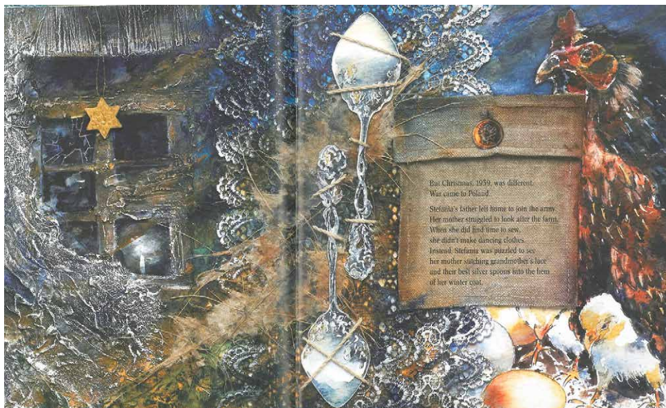
Fig. 4 Illustration from Stefania's Dancing Slippers foreshadows the family's impending entrapment.

Sl. 4. Ilustracija iz slikovnice Stefania's Dancing Slippers [Stefanijine plesne papučiće] koja nagovještuje stupicu što se priprema obitelji.