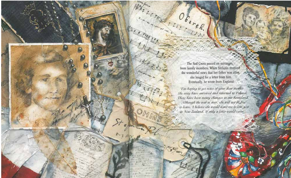
Fig. 5 Illustration from Stefania's Dancing Slippers references significant cultural motifs explored in the text.

Sl. 5. Ilustracija iz slikovnice Stefania's Dancing Slippers [Stefanijine plesne papučiće] upućuje na važne kulturne motive koji se razrađuju u tekstu.