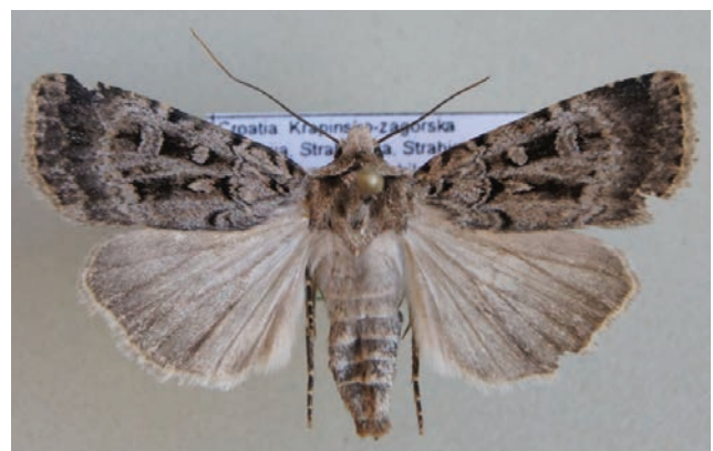
Figure – 3 Figure 3. Chersotis multangula from Mt. Strahinjščica, July 20 th , 2014.

Besides Ch. rectangula , on the same locality and date we recorded another congeneric species, Ch. multangula (Fig. 3). Another two records of this species were made on the