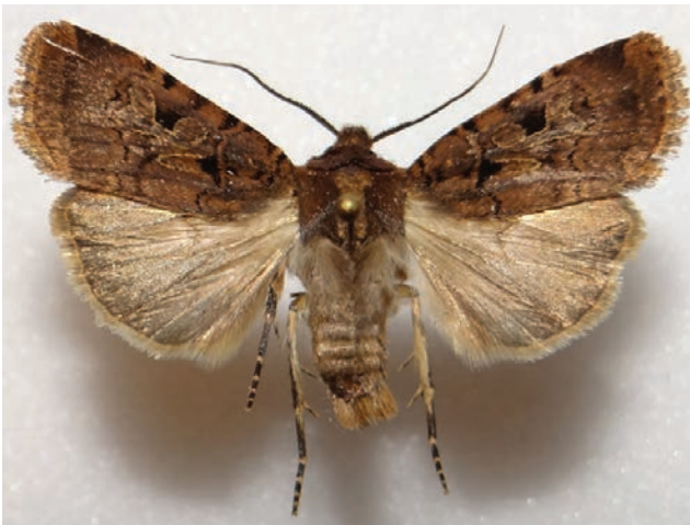
Figure 2. Chersotis rectangula from Mt. Ivanščica, June 8 th , 2014.

Slika 1. Novi i povijesni nalazi vrste Chersotis rectangula i Chersotis multangula na planinama Strahinjščici i Ivanščici. Dva južnija nalaza vrste Ch. multangula na karti Hrvatske predstavljaju literaturne nalaze.