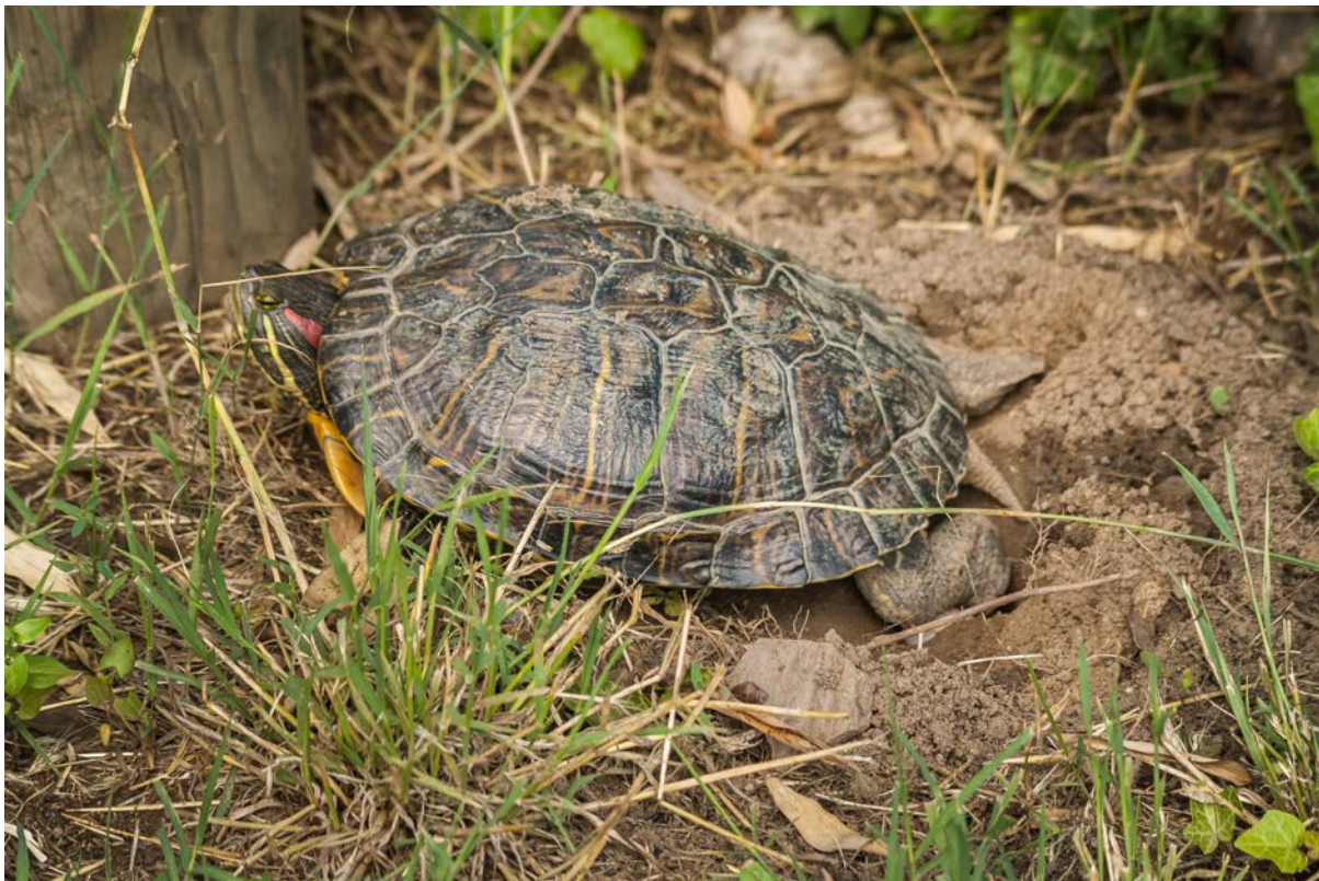
Figure 2. A large red-eared slider laying eggs in Novi Sad