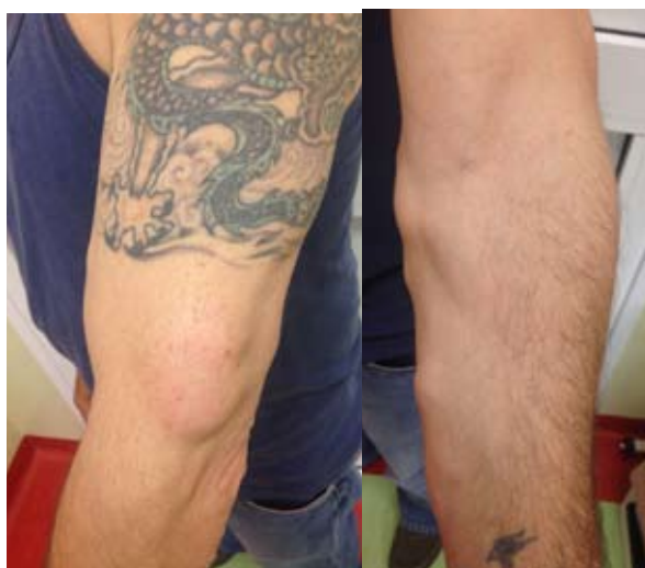
Figure 1. a: Lipomas and tattoo of the arm; b: Lipomas of the arm

The patient said that these lesions appeared after making a tattoo on his arm. The tattoo was admin-