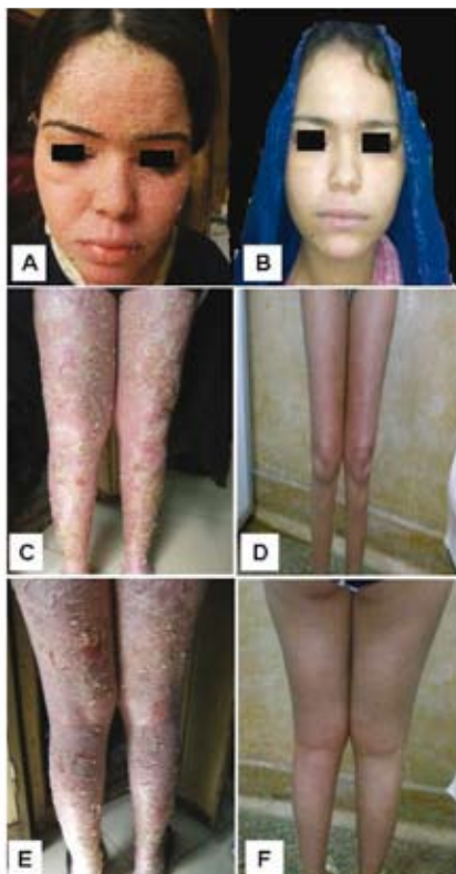
Figure 2. A female patient aged 25 years with erythrodermic psoriasis. A: The face of the patient at baseline with scaly erythematous lesions. B: The face 3 months after modified Goeckerman's technique (GT). C: The anterior view of both lower limbs at baseline. D: The anterior view of both lower limbs 3 months after modified GT. E: The posterior view of both lower limbs at baseline. F: The posterior view of both lower limbs 3 months after modified GT. Photos B, D, and F show an excellent response (Grade 4).

that activates coal tar, it has not been used because of its known phototoxic reactions, especially in patients with white skin (15).