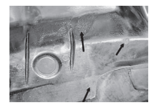
Figure 2 Mold erosion wear [7]

Surface damage is also usually caused by corrosion originating from the dissolution of the mold material in the molten metal and emerging intermetallic compounds [5].