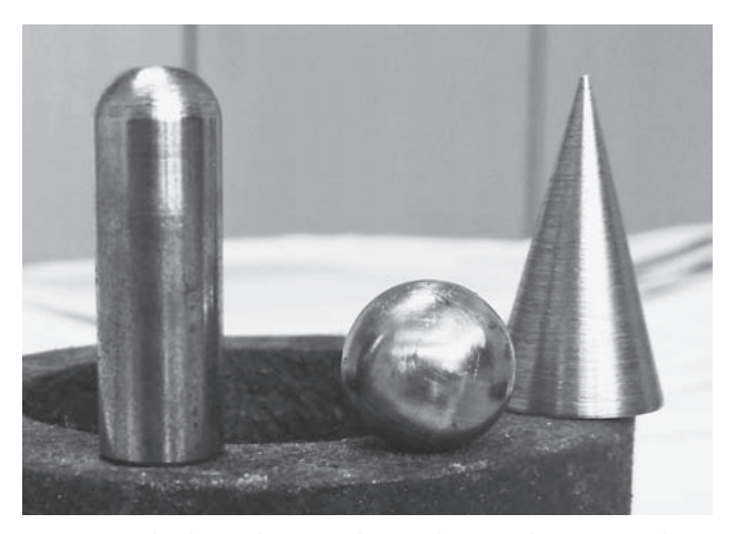
Figure 3 Cylinder with a rounding, sphere and cone sample

The main cause for the soldered metal is the tribochemical interaction between the molten aluminum alloy and the die steel surface that results in intermetallic formation and adhesion [10]. Soldering of metal and development of intermetallic compounds can be avoided by using a special lubricant. Graphite and molybdenum disulfide ( MoS_2 ) are the predominant materials used as solid lubricant. Like graphite, MoS_2 has a hexagonal crystal structure with easy shear property. Due to their lamellar structure these materials are effective lubricant additives. The lamellas are oriented parallel to the surface in the direction of motion. Even between highly loaded stationary surfaces the lamellar structure is able to prevent contact. In the motion direction the lamellas easily shear over each other re-