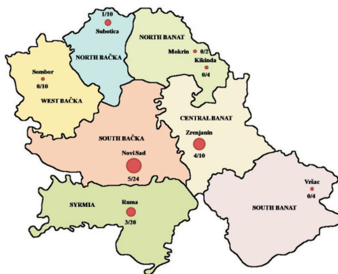
Fig. 2. Distribution of the positive and total samples by districts of the Autonomous Province of Vojvodina