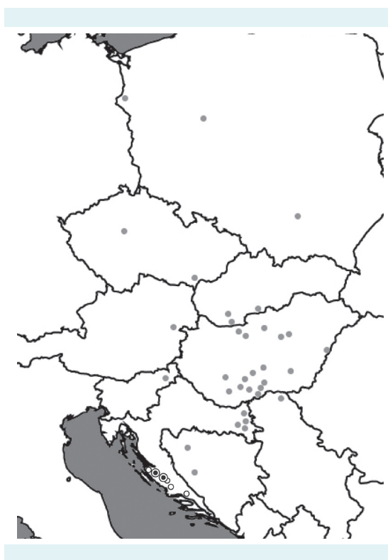
FIGURE 1. Archaeological sites included in craniometric analysis. Gray circles show previously analyzed continental sites, white circles show previously analyzed Eastern Adriatic coast sites (6), and circled dots present newly added Eastern Adriatic coast sites.

Cranial measurement data for 13 Šopot and 10 Ostrovica skeletons, as well as previously published craniometric data for medieval central European populations (6) (Figure 1) were compared using PCA (Figure 2). The two first principal components explained 51.35% of the variability in the sample sets. In the first principal component, weight was given to breadth measurements (maximum cranial breadth and bizygomatic breadth). In the second component, almost similar weight was given to basion-bregma height, minimum frontal breadth, orbital breadth, and maximum cranial length. As this component covers all three dimensions (width, height, and length), it is associated with the general size of the cranium. All major variables had positive coefficient signs, which means that the breadth of the cranium increased from left to right on the x-axis, and general cranial size increased from bottom to top on the y-axis (Table 2). Šopot and Ostrovica sites were positioned in proximity to one another and clustered together with other Eastern