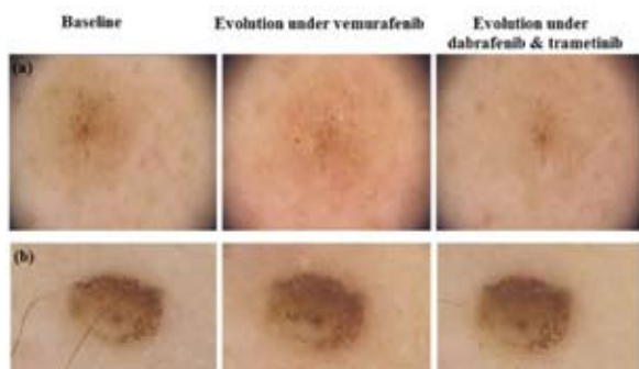
Figure 6. Evolution of globular nevi: (a) diffuse decrease in pigmentation during vemurafenib treatment, followed by further decrease in pigmentation during dabrafenib and trametinib therapy; (b) diffuse decrease in pigmentation during vemurafenib treatment, and stable nevus during dabrafenib and trametinib therapy.