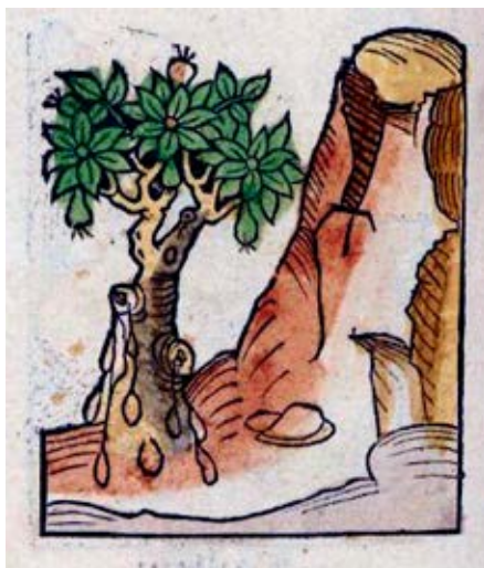
Figure 1. The origin of amber as a tree resin ( Hortus Sanitatis , de Lapidibus, Cap. lxx, 1491). From a copy held in the Boston Medical Library in the Francis A. Countway Library of Medicine, Boston, MA, USA.

ally all of the amber employed for medicinal purposes in Europe originally came from the Baltic coast although it should be noted that small pockets of amber deposits are also known from Sicily, Denmark, Germany, Sweden, Poland, Lithuania and Romania. In addition to its decorative nature, amber was worn as an amulet to counteract evil spiritual influences and to protect the head and throat against infection, to act as a prophylactic against the plague, to ensure unimpeded lactation in nursing mothers, to act as an antivenin, as a cure for ocular problems and to fasten loose teeth! Applied topically in plasters, salves, unguents, poultices, ointments, balsams and cataplasms, it was often combined with numerous aromatic gums and resins to give relief from a wide range of diseases. Burnt as a fumigant, the smoke produced by amber was inhaled to assist with childbirth and to treat epilepsy 7 .