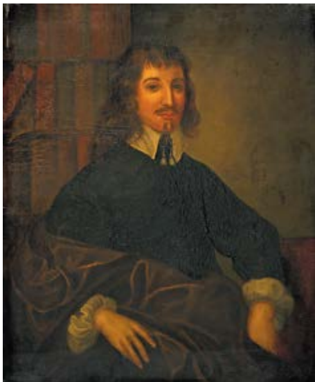
Figure 8. Portrait of Nicolas Culpeper (1616-1654).

mother of pearl and 'Bones of Microcosme' (human bones?). Croll recommended its use in cases of dysentery, lientery (excretion of partly or wholly undigested food), nosebleeds, excessive menstrual flow and bleeding during pregnancy 58 .