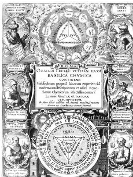
Figure 7. Title page of Basilica Chymica (Frankfurt, 1609), by Oswald Croll (c. 1563-1609).

Oswald Croll (1563-1609), alchemist, imperial physician to Rudolph II and formerly Professor of Medicine at Marburg University, incorporated amber into 'A Dysenterick Powder of admirable virtue' in his Basilica Chymica (1609) (Fig. 7). The powder also contained sanguis draconis , haematite, red coral, seeds (purslane, plantain and anthora [Healing Wolfsbane]), tormentil root, terra srigensis , nutmeg, cinnamon, crocus martis , and calcined talc,