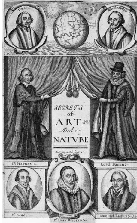
Figure 10. Title page of Secrets of art and nature (1600) with portrait of Johann Wecker (1528-1586).

The Swiss physician, Johann Jakob Wecker (1528-1586; Fig. 10) suggests an electuary ‘against dangerous and pestilent diseases of children’, composed of ‘a little of the bone of the heart of a Stag, and of Unicorn’s Horn, red Corall, white Amber, Pearls, Pouders of Gold and Elk’s Claw’. Beaten to a powder, they were then delivered in either Rose Water or Lavender Water 67 .