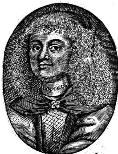
ELIZABETH Grey Countess of Kent.