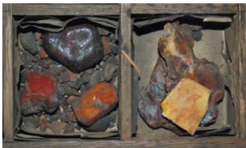
Figure 2. Amber ( Succinum Citrinum and Succinum Album ) from Drawer 15 of William Heberden's early 18 th century Materia Medica Cabinet . By permission of the Master and Fellows of St John's College, Cambridge.

its common incorporation into a range of medicines 8 . Interestingly, within these cabinets, pieces of amber are invariably grouped together with geological materials (minerals, fossils, rocks and earths) rather than with gums and resins.