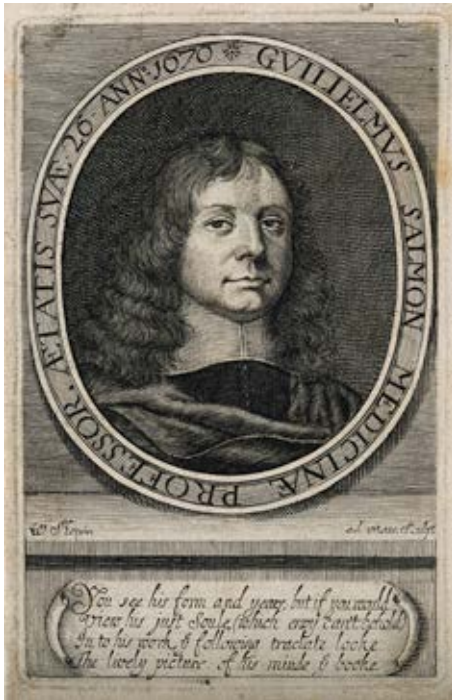
Figure 6. Portrait of William Salmon (1644-1713). Line engraving by W. Sherwin, 1671.

The somewhat similar Powder of Crab's Claws involved adding pearls, red coral, amber, bezoar stone, crab's eyes and hart's horn to the claw tips, rendering the mixture to a powder and then binding it together with viper skin jelly; the resulting material was then fashioned into troches or tablets. White coral replaced the red variety, and hart's horn jelly replaced that produced from viper skin in the closely similar Gascon Powder 53 .