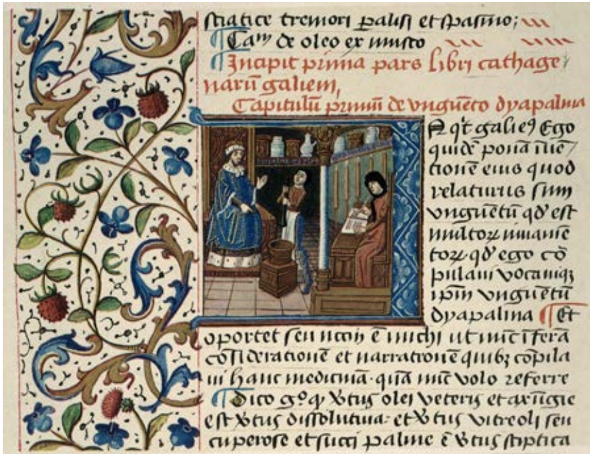
Figure 3. Galen (circa 129-200), and an assistant with a pestle and mortar, plus a scribe in an apothecary's shop. Miniature (no. 37.181) from a 15th century manuscript in Dresden.

Callistratus further, according to Pliny, indicated that amber was 'good for any age, as a preventive of delirium and as a cure for strangury, either taken in drink or attached as an amulet to the body'.