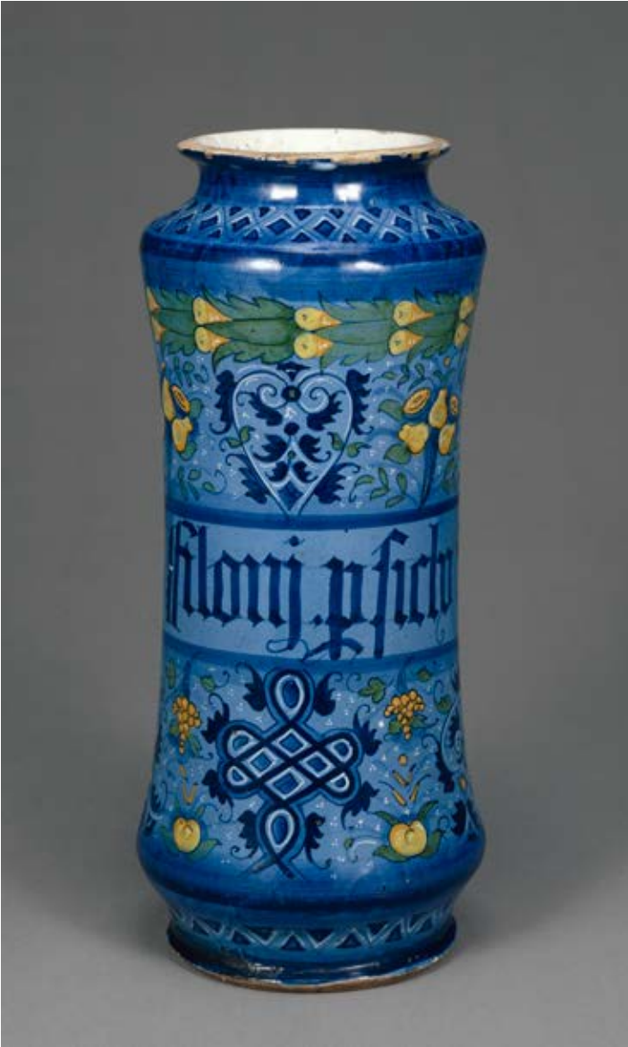
Figure 9. Tin-glazed earthenware drug jar for storage of Persian philonium (Italian, Faenza, about 1520 – 1530). The Getty Museum.

might use it, as well as for Wine and Stone Colick, and to make her blithe and buxome, when she was to club with the king her husband in the great business of making Princes and Princesses'. Administered in three ounces of white wine with a spoonful or two of 'Syrupe of Marsh-mallows',