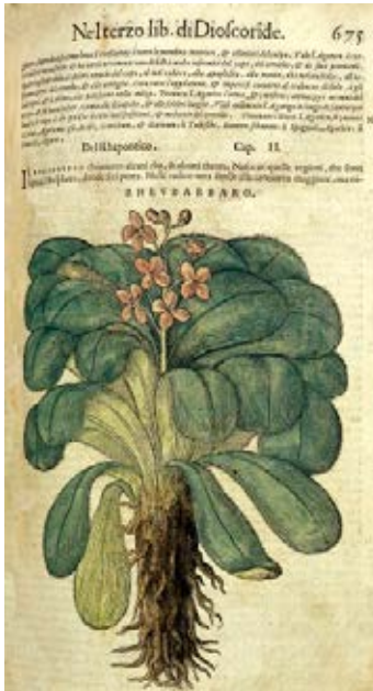
Figure 1 - Illustration of rhubarb from Pietro Andrea Mattioli's Italian translation of Dioscorides, ed. 3, Venice, V. Valgrisi, 1568, p.675.