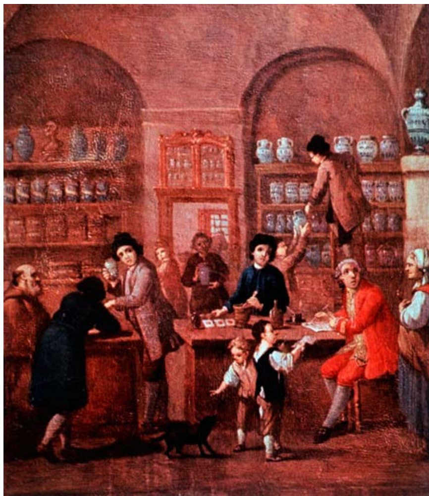
Figure 4 - Hospital pharmacy in the city of Vercelli (northern Italy). Painting of unknown author. 18 th century.

use of the simples. However, it was also influenced by iatrochemistry, which, following the paracelsian theories, had a great influence on pharmacy. The texts characterized by iatrochemistry increased in the second half of the century, when the library was enriched with more recent works. The analysis of the inventories demonstrates the presence of both the galenic-arabic and chemical traditions, therefore reflecting an 18 th century pharmacy (fig. 4) supplied with a composite literature.