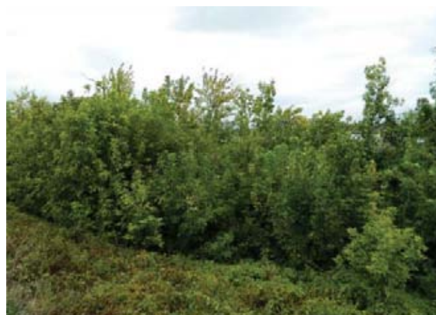
Figure 3. The Ass. Rubo caesii – Aceretum negundi ass. nova Slika 3. Nova asocijacija Rubo caesii – Aceretum negundi

Diagnostic species: Carex otrubae ( \Phi = 0.73 ), Lycopus europaeus ( \Phi = 0.66 ), Glyceria maxima (Hartman) Holmberg