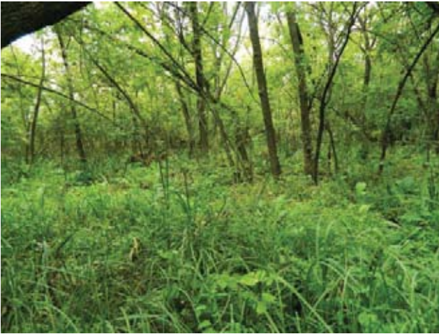
Figure 4. The Ass. Carici otrubae – Fraxinetum pennsylvanicae ass. nova Slika 4. Nova asocijacija Carici otrubae – Fraxinetum pennsylvanicae

( \Phi = 0.66 ), Fraxinus pennsylvanica Marshall ( \Phi = 0.63 ), Solanum dulcamara ( \Phi = 0.55 ), Polygonum hydropiper L. ( \Phi = 0.45 ).