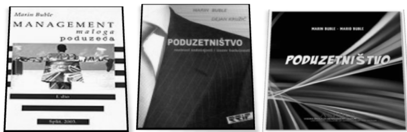
Figure 2. Published textbooks in the field of management of small enterprises and entrepreneurship

popular and were used at practically oriented (professional) studies, as well as undergraduate and graduate study programmes established in accordance with the Bologna process (see Figure 2).