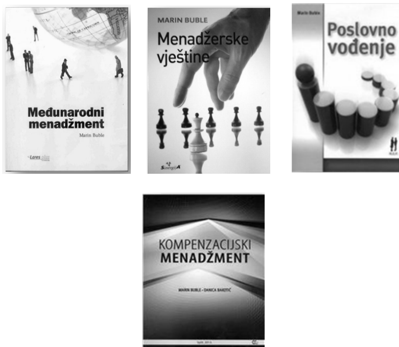
Figure 3. Published textbooks in the field of specific areas of management