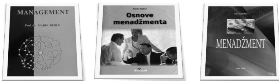
Figure 1. Published textbooks in the field of general management

However, the key factor of his recognition and his scientific contribution to the field of management, both in Croatia and in the wider region, are numerous textbooks and monographs he has written. Many generations of students acquired their first knowledge in the field of organization and management from these books, and many of them have later held major managerial positions. First of all, due mention should be given to the fundamental textbook in the field of general management, which has established itself by its quality and comprehensiveness as an indispensable textbook standard. The aforementioned book has seen great success and a number of new editions (Figure 1), and in 2006 it was adapted to the new, Bologna programme (entitled Fundamentals of Management – Osnove menadžmenta ).