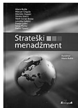
Figure 4. Strategic management publications