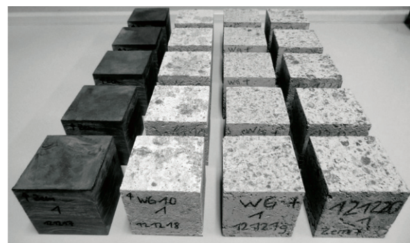
Figure 1 Specimens for compressive strength testing Slika 1. Uzorci za ispitivanje tlačne čvrstoće

When producing specimens for the pressure test based on the results of the preliminary tests, it was found that the dust reduced specimens (sample ID E and F) did not solidify. Thus, only the sample rows B, C and D were examined further and compared with the samples consisting of pure cement (sample row A). Water-resistant plywood, coated with phenolic resin, was used for the mould. After 20 hours, the test specimens were removed from the mould and then stored in sealed bags, where they were kept for two weeks at 21 °C. Subsequently, they were removed from the bags and preserved for a further two weeks with the prevailing ambient laboratory climate (21 °C / RH 35 %) to