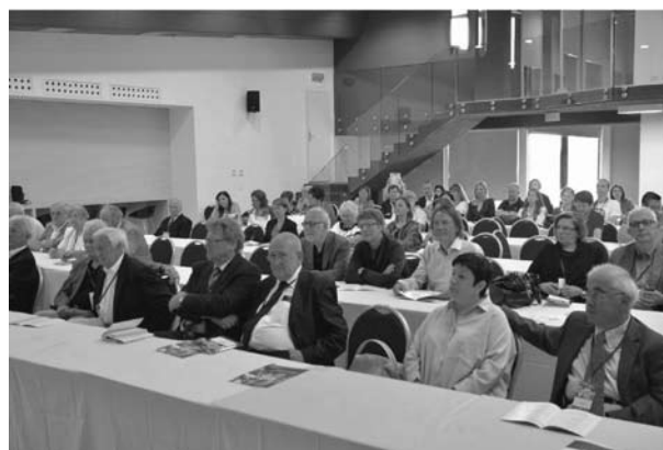
Fig. 1. Opening of the 54 th International Neuropsychiatric Congress in Pula.

The main theme of the congress was Lifestyle and Prevention of Brain Impairment. In addition to lectures on the main theme, the Congress included a number of accompanying symposia, in particular the 3 rd European Summer School of Psychopathology, 7 th International Symposium on Epilepsy, 2 nd Neuro-Interdisciplinary School, 3 rd Symposium on the Interface Providers in Neurorehabilitation, psychiatric symposia on the new Act on the Protection of Persons with Mental Disorders, Symposium on Forensic Psychiatry, symposia on ADHD, on treatment of advanced Parkinson's disease, activities of the Andrija Štampar Association of Public Health in stroke prevention, on a common approach to diagnosis, treatment and follow up of Anderson Fabry disease in South-East Europe region, and on cerebral aneurysms, palliative care, on atrial fibrillation and secondary prevention of stroke, and on different therapeutic approaches in the treatment of neurological and psychiatric diseases. On Saturday, a joint meeting with the Alps-Adria Neuroscience Section,