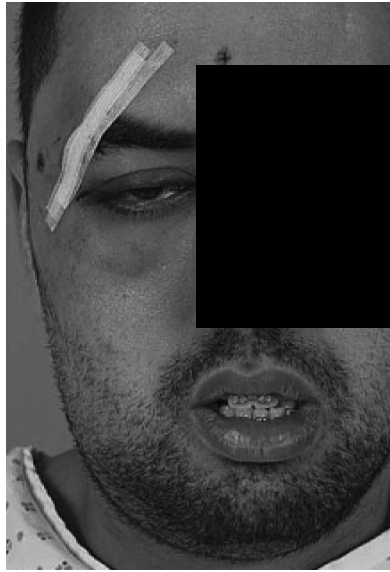
Figure 2. Anterior view of stab wounds.