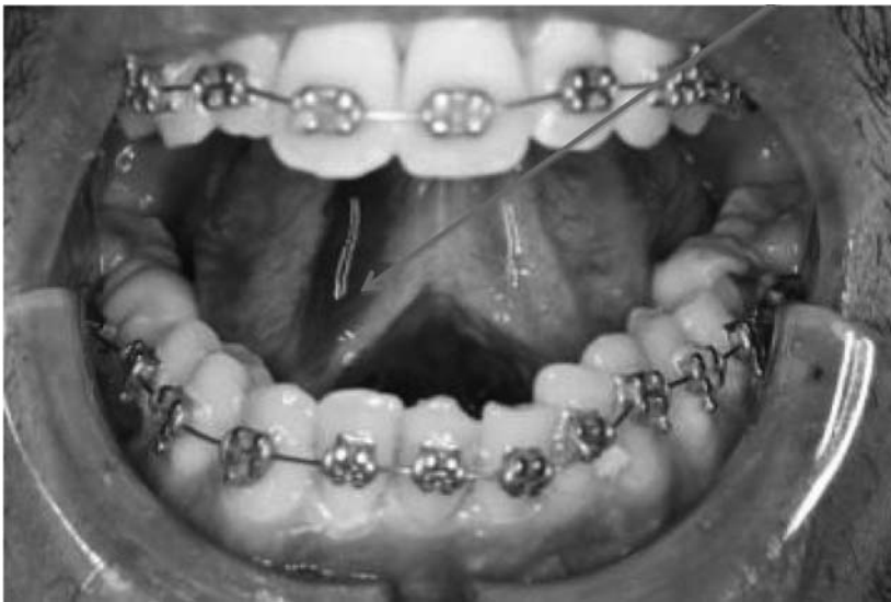
Figure 2. Sublingual haematoma.