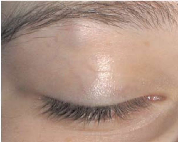
Fig. 1. Oval, well circumscribed, subcutaneous mass measuring approximately 7x4 mm under medial upper orbital margin, under the right eyebrow.

usually arises from the lids and eyebrows 1,6 . It presents as a painless, slowly enlarging, firm to hard, well-circumscribed, subcutaneous mass 4-6 , with average size of 10 mm or less 6 that slides freely over the underlying tissues 2,4 . The overlying skin is usually intact with reddish to blue discoloration due to dilated blood vessels 3,5 .