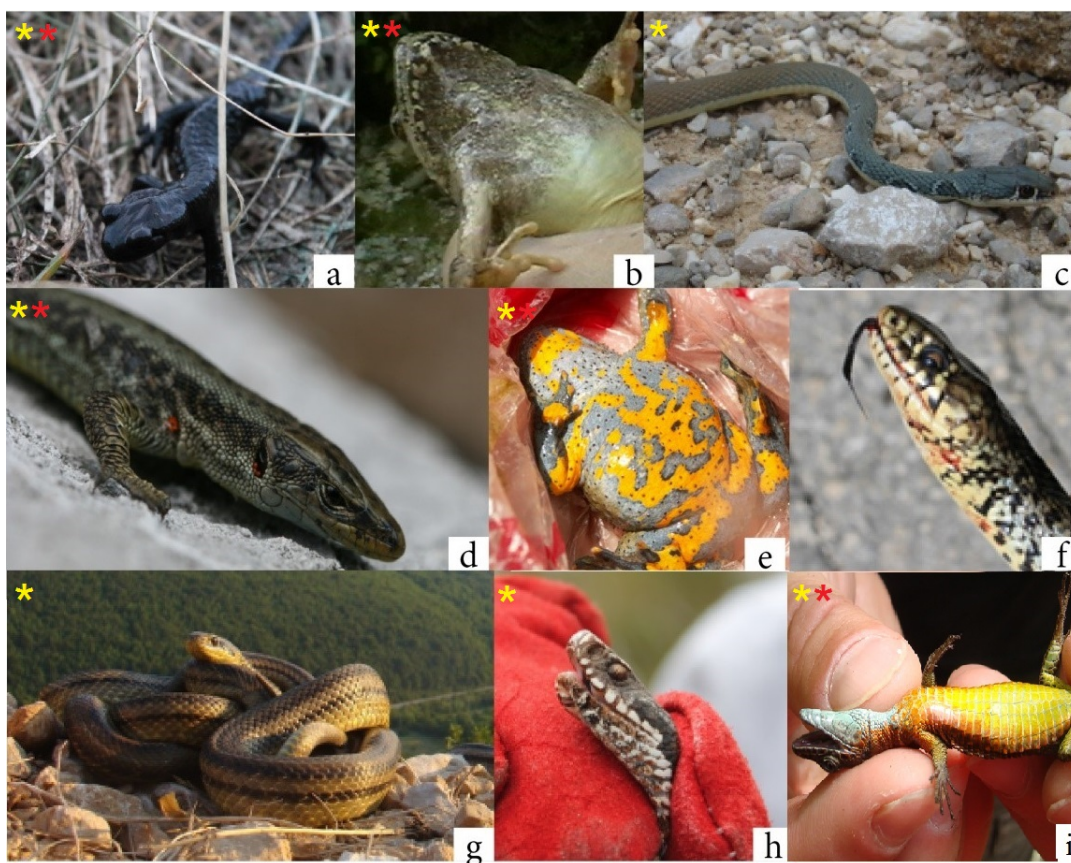
Figure 3. Photographs of some rare, NATURA 2000 species (📍) and species from the local Red List (*): a) S. atra prenjenensis ; b) R. graeca ; c) P. najadum dahlii ; d) D. mosorensis ; e) B. variegata ; f) H. gemonensis (the northernmost finding); g) E. quatuorlineata ; h) V. berus bosniensis ; i) A. nigropunctatus .

Slika 2. Broj literaturnih i terenskih nalaza s istraživanog područja u period od 141 godine.