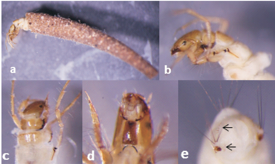
Fig. 2. (a) larva in the case; (b) lateral view of head and thorax; (c) dorsal view of head and thorax (d) ventral apotome of the head; (e) anal proleg