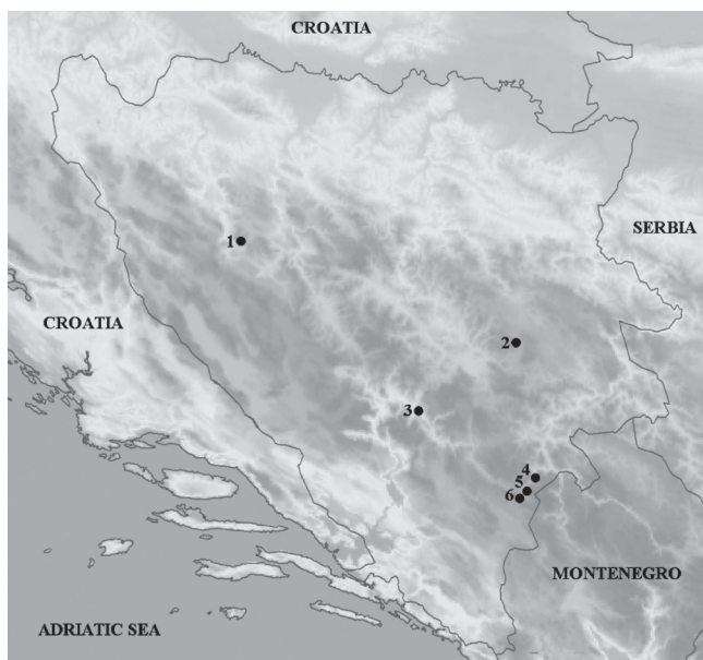
Fig. 1. Sampling sites of aquatic dance flies recorded in this study from Bosnia and Herzegovina.