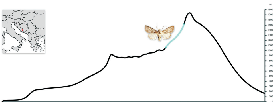
Fig. 2. Schematic representation of Mt. Biokovo profile marked with the area where Antitype suda was recorded.

Identification was based mainly on the description of genital features by RONKAY et al. (2001), BERIO (1985), RÁKOSY (1996) and HACKER (1989). The main biological features and the distribution map are given according to RONKAY et al. (2001) (Fig. 1). Systematic presentation follows FIBIGER et al. (2011).