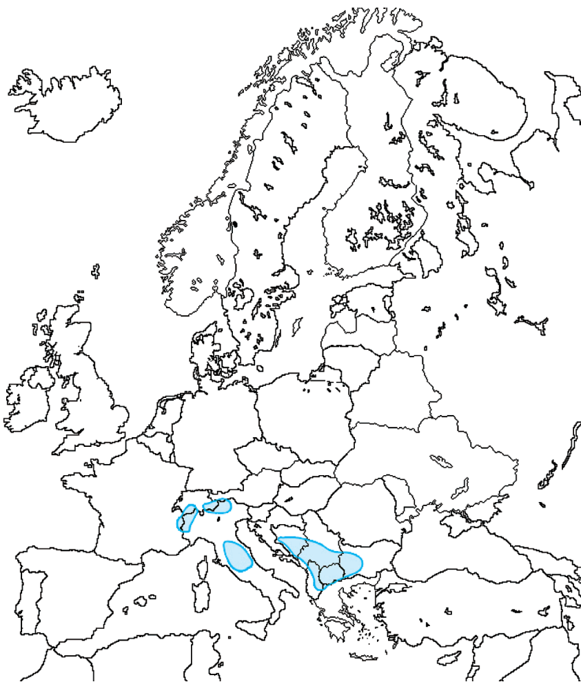
Fig. 1. Geographical distribution of Antitype suda according to RONKAY et al. (2001).

Specimens of Lepidoptera were collected using a UV lamp connected to a transportable generator of 1 000 W. After 2006, it was replaced by portable 15 W battery. Voucher specimens are deposited in the Croatian Natural History Museum as part of the following collections: the Mihoci Collection, Kučinić Collection and Vajdić Collection. Two specimens of Antitype suda are placed in the Central Collection of Hesperioidea and Macroheterocera in the Croatian Natural History Museum.