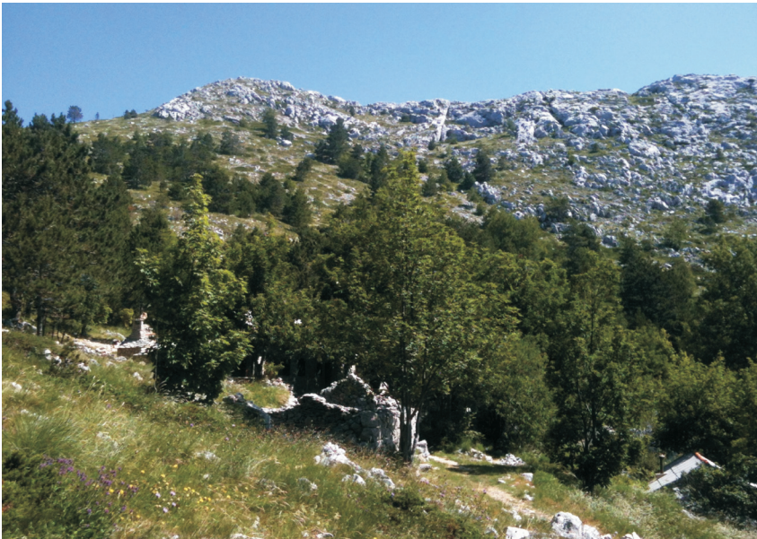
Fig. 6. Typical habitat at which Antitype suda was collected on Mt Biokovo, locality L11 1485 meters a.s.l.