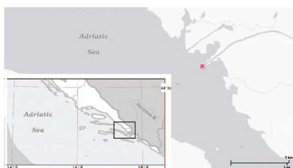
Fig 2. New record (x) of Caranx crysos in the waters of the Neretva River estuary