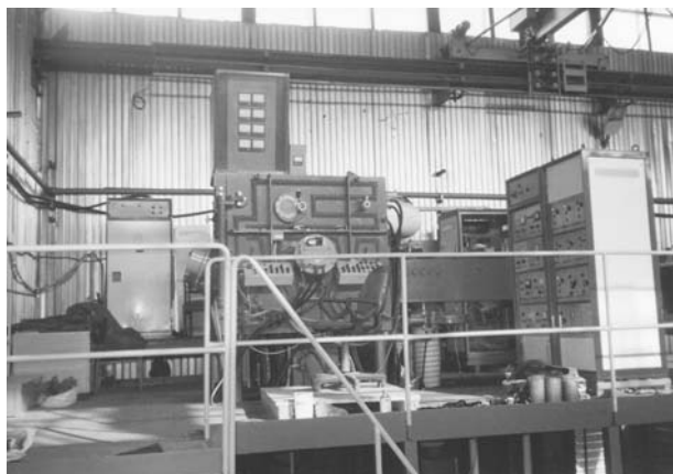
Figure 2. General views of electron-beam installation for obtaining composite materials for electrical contacts Slika 2. Pogled na elektro-lučno postrojenje za pridobivanje kompozitnih materijala za elektro-lučne kontakte

The "GEKONT"-company has designed and patented the new industrial technology of obtaining of materials for electrical contacts, which are not having of clones in the world [6, 7]. General view of the industrial electron-beam installation for obtaining materials for electrical contact has shown in a Figure 2..