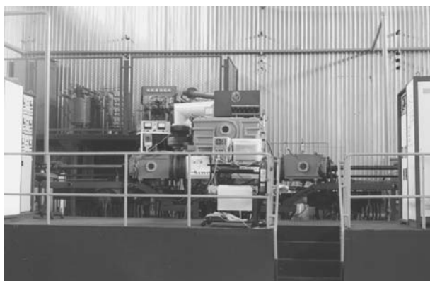
Figure1. General view of electron-beam equipment for deposition of protective coverings

The modern heat-protective coatings, having the greatest operational resource, put on a defended item basically by the two-steps of technology. On such ways, in particular, there was the American company "Pratt and Whitney". An internal metallic layer Ni(Co)CrAlYHfSi- deposits by the plasma spraying, and external ceramic layer (ZrO 2 -Y 2 O 3 )- by electron-beam deposition.