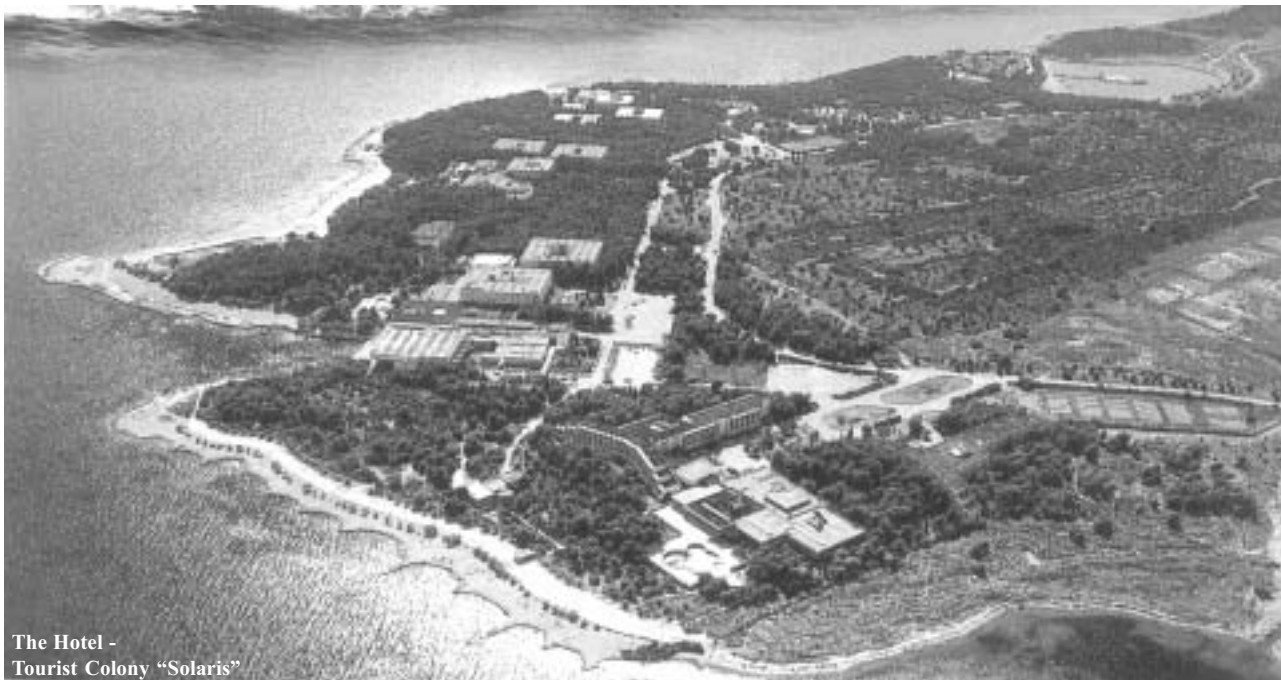
The Hotel - Tourist Colony "Solaris"