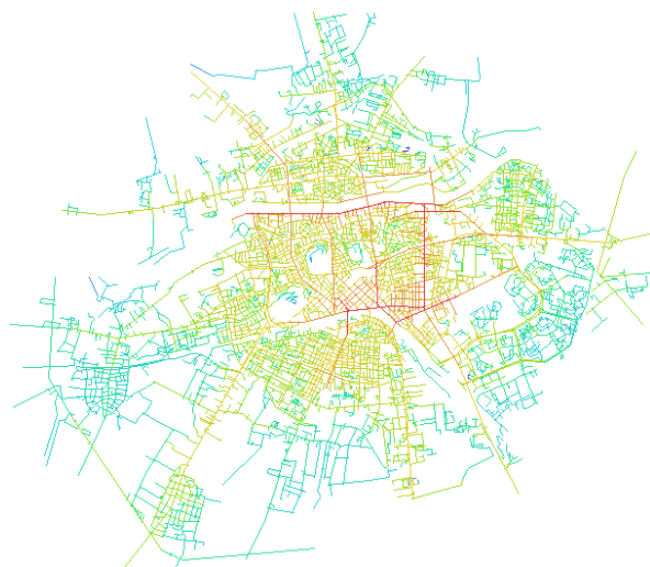
Figure 2* Axial total integration map of the city of Plovdiv. Red colour indicates higher while blue indicates lower integration

Field noise measurements had been carried out by municipality experts following the ISO 1996-1/2005 (27) and ISO 1996-2/1987 procedures (28). Sound levels were measured in the field using "Brüel & Kjær Type 2240" sound meter and "Brüel & Kjær Type