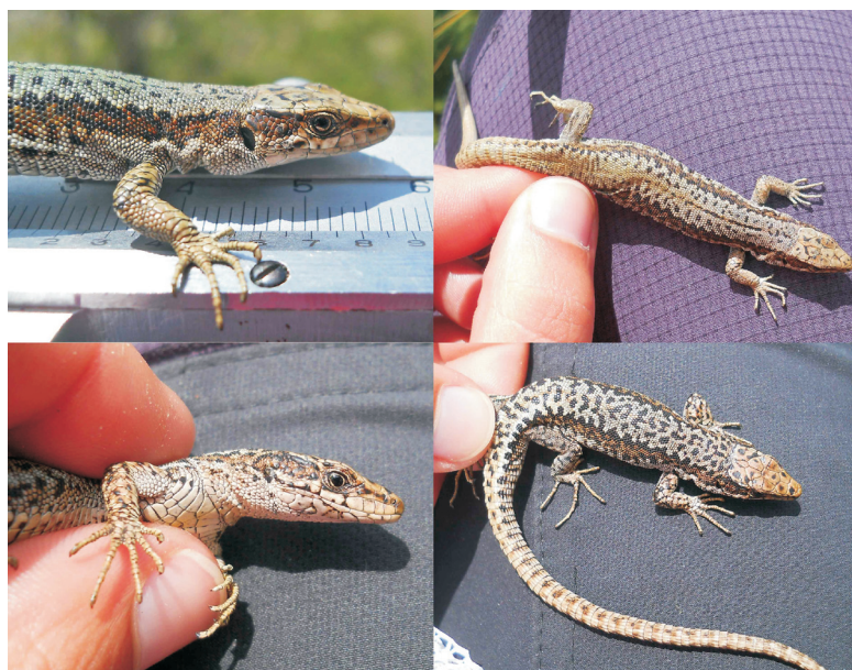
Fig. 2. Photographs of right and dorsal sides of a female (above) and male (below) Horvath's rock lizard ( Iberolacerta horvathi ) found on Dinara Mountain (Croatia).