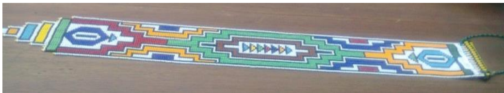
Figure 1. Zulu beadings

In another topic, artefacts from the Ndebele paintings and beadings, collected from the cultural village (see Figures 1 and 2 below) were used to teach properties of shapes and transformations.