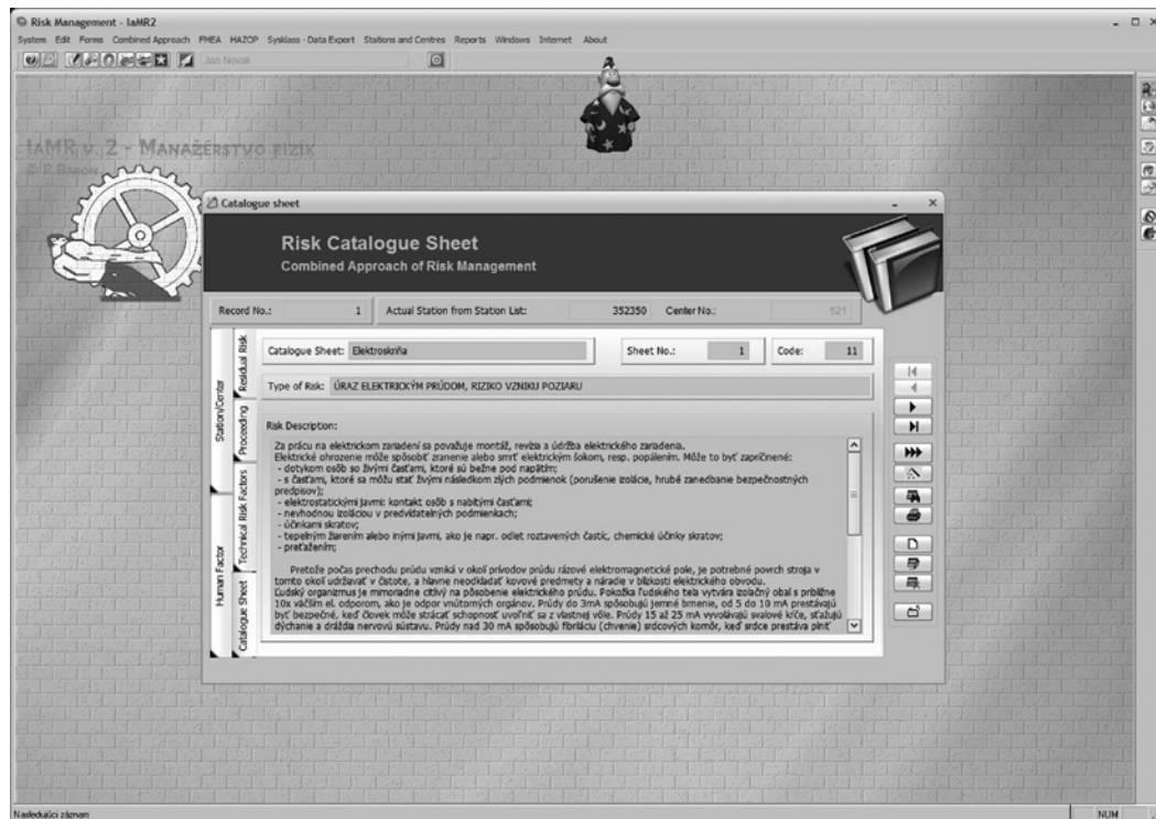
Figure 2. Catalogue sheets processing for risk valuation of functional segments of observed device

Slika 2. Procesiranje kataloškog lista za vrednovanje rizika funkcionalnog segmenta za promatrani uređaj.