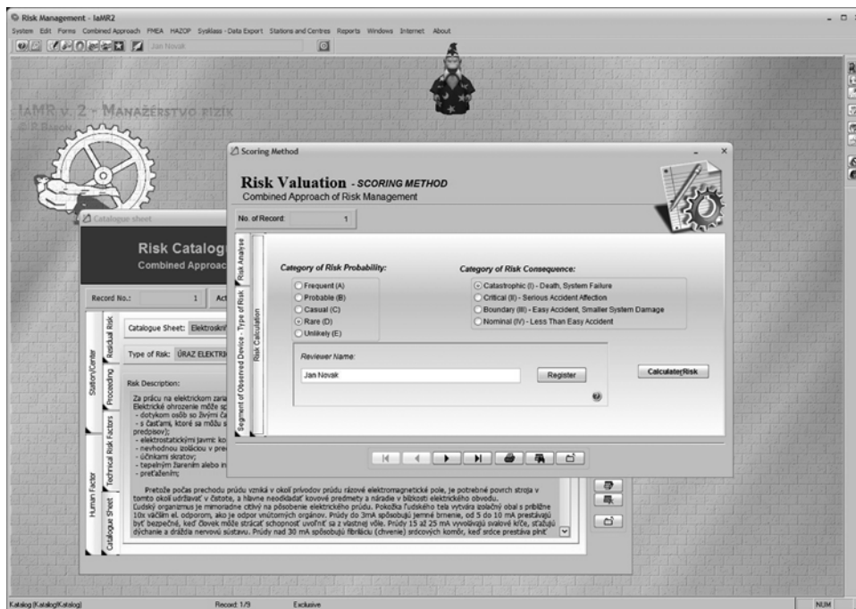
Figure 4. Calculation of risk using scoring method