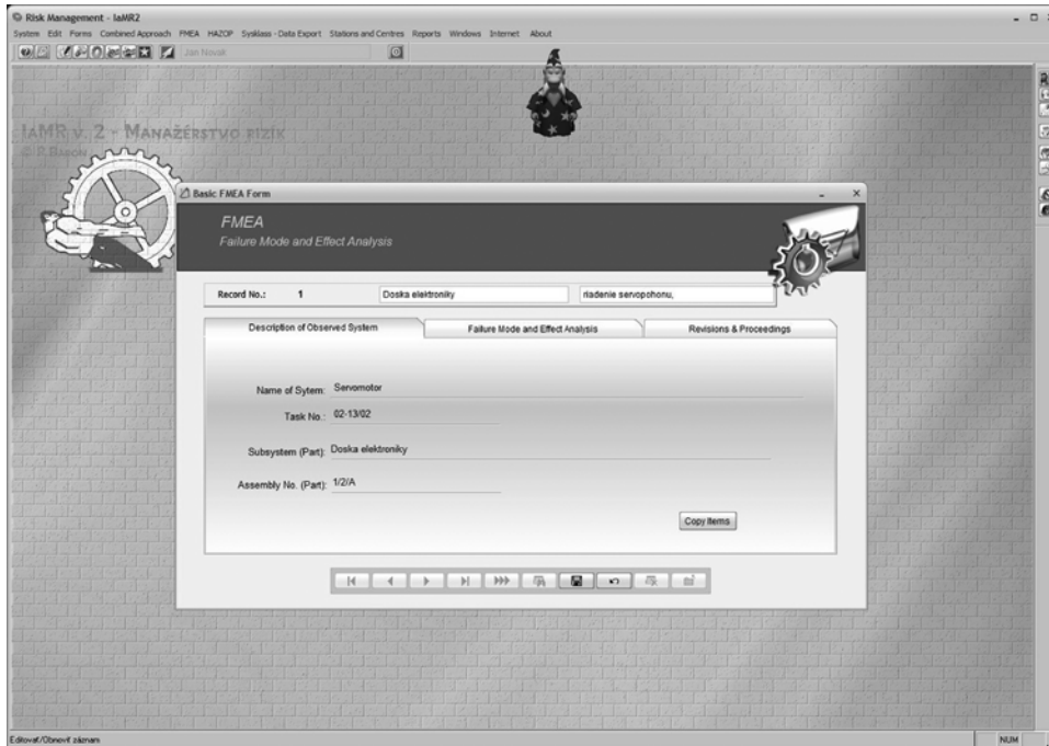
Figure 5. Dialogue form for identification of design unit errors realized with FMEA method Slika 5. Dijaloški obrazac za identifikaciju grešaka pomoću FMEA metode.

divergence are examined. Such proceeding peg group of theoretical divergences from common purpose. Every one divergence need to be valuated and determined for possible consequences.