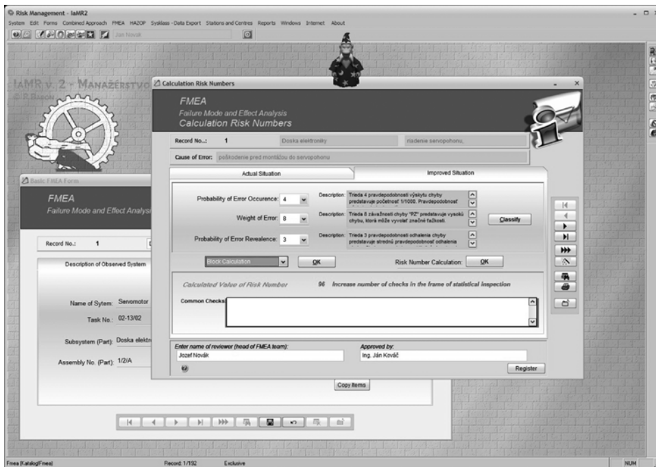
Figure 6. Dialogue form for risk number calculation of review segment Slika 6. Dijaloški obrazac za izračun rizika promatranog segmenta.