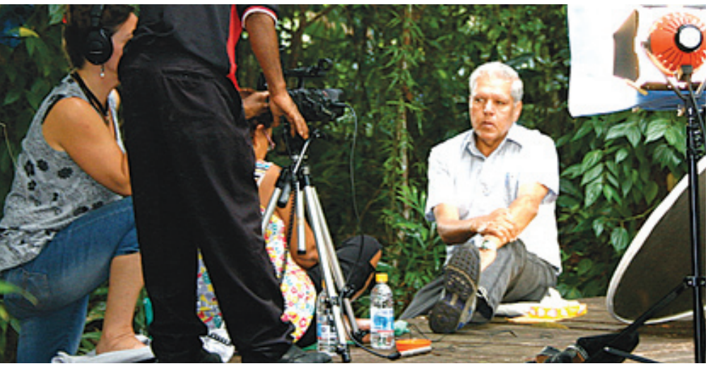
The HITnet team filming on location at Yarrabah

However, project partners were cognisant of the fact that a dangerous trap can occur when people seek to commodify interventions and communities. The part of the experience that is important is finding solutions and, therefore, empowering strategies, such as Building Bridges, are about process. The horizontal information sharing creates links for learning and for exchanging information with other communities that have been able to move forward. Nonetheless project partners recognise that there are differences between communities, particularly DOGIT communities and the Indigenous communities in urban areas. It is essential therefore to be cautious about extrapolating from one community to another.