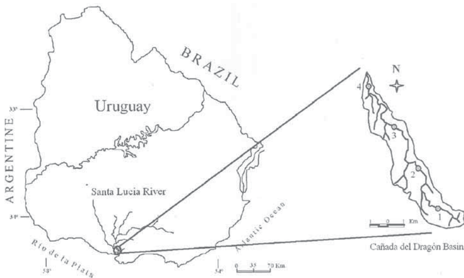
Figure 1. Map of the study area, showed the four sampling sites of Cañada del Dragón stream, Santa Lucía river basin. Mapa del área de estudio, se muestran los cuatros sitios de muestreo en el Arroyo Cañada del Dragón, Cuenca del río Santa Lucía.

These parasites can promote different effects in different fish species with consequences at the population level. In this sense, the aim of the present study was to identify fish species susceptible to black spot disease, its temporal variation regarding intensity, prevalence, abun-