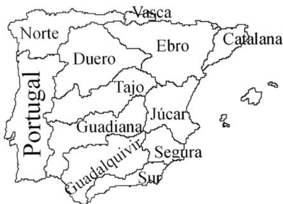
Figure 1. Watersheds distribution in Spain. Distribución de las cuencas de drenaje en España.

Fifty eight percent of the 19 reservoirs investigated in the Norte Basin, presented potentially toxic cyanobacterial dominance, and in only 10% of the reservoirs cyanobacteria were scarce. In the rest of the reservoirs (32%) cyanobacteria were abundant (Figure 2). Similar patterns were found in all the western