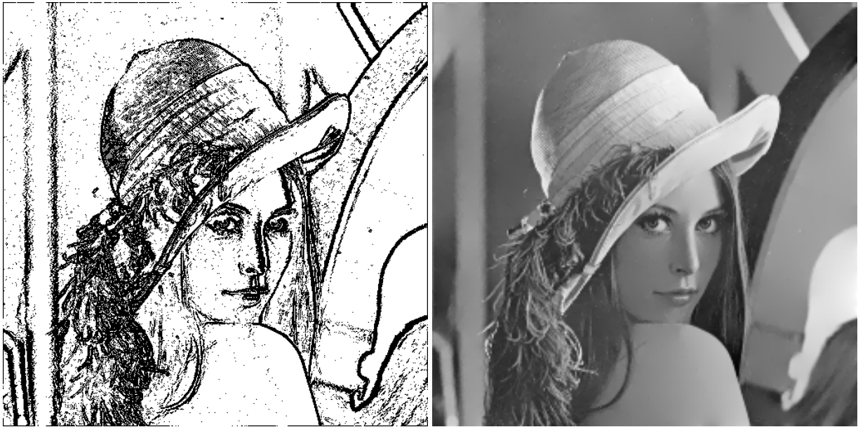
Figure 6: Left: MSM with Lorentzian wavelet, h_{\infty} = -0.5 \pm 0.2 . Right: reconstructed image (PSNR=24.52 dB)