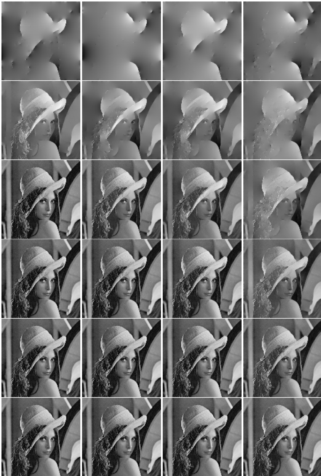
Figure 5: Accumulated reconstructed images, from the reconstructed images in Figure 4