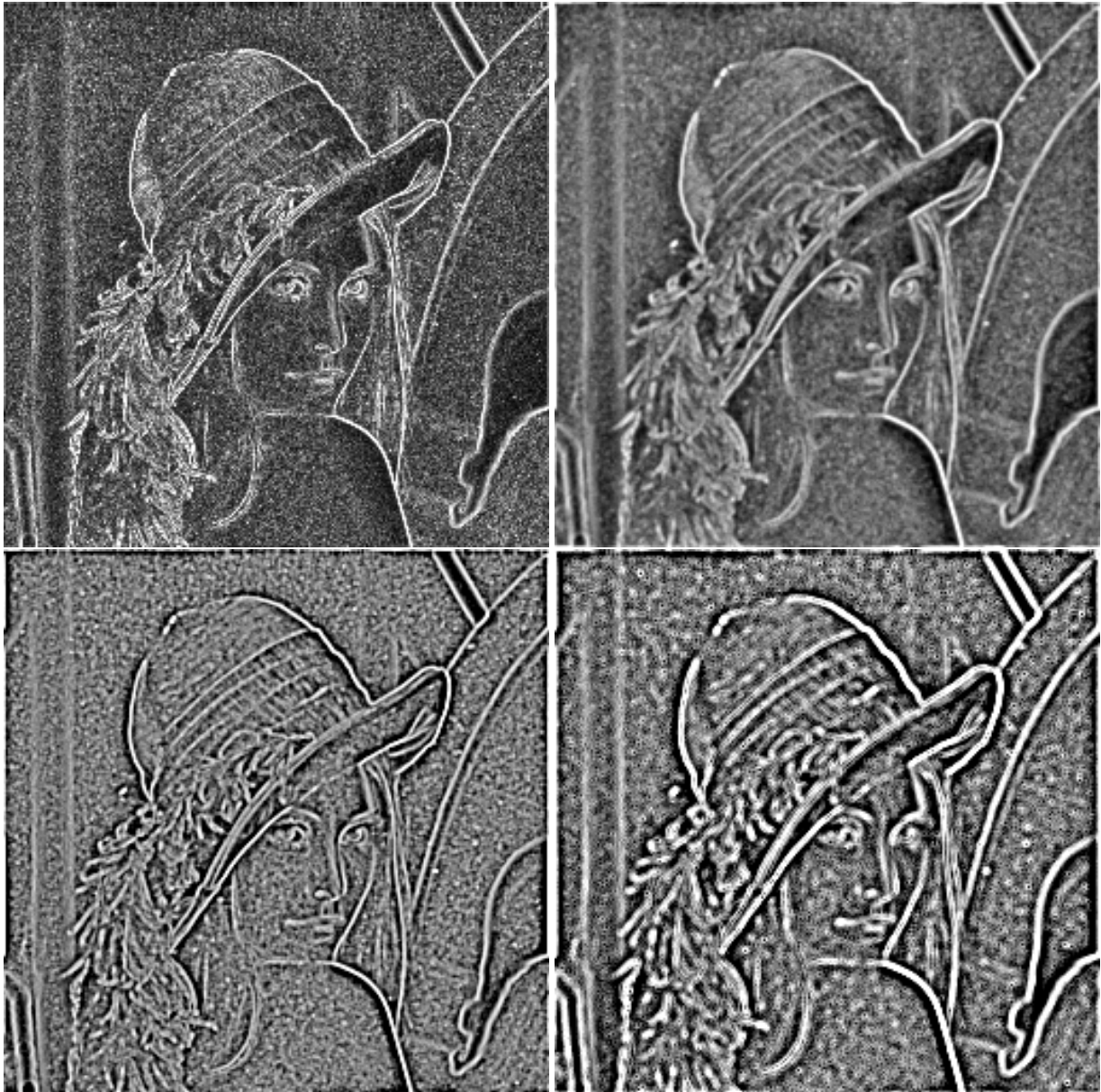
Figure 2: Multifractal decompositions on Lena's image for Lorentzian wavelet and its derivative (top) and Gaussian wavelet and its second derivative (bottom) (see Section 5). The smaller is the singularity exponent, the brighter is the point.