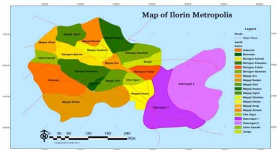
Fig. 1(b) The twenty wards of Ilorin Metropolis