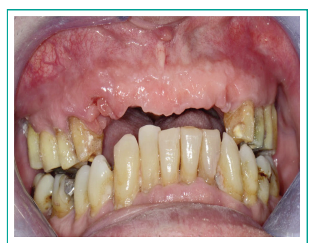
Figure 3 The maxilla after extraction of residual root 1.3.

INR values were higher than 2.0 for two times, as suggested by Rossi & Magrella (19). After two samples with an INR> 2, the warfarin therapy was taken up only.