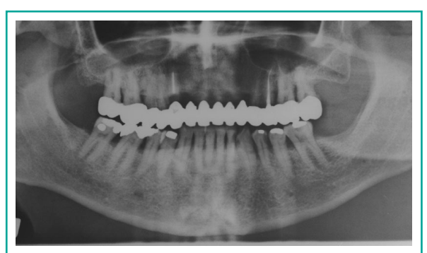
Figure 1 Rx Orthopanoramic before treatment.

We did the mechanical preparation, using Winsix's incremental pre-calibrated drills of length 13 mm, maintaining an under-preparation of 2 mm in each implant's locus, due to the compactness of bone type D2. We insert a post-extraction implant Winsix TTx Micro Rough Surface internal hex conical, length 13 mm and diameter 4.5 mm in area 1.3, inserting the vestibular cortical