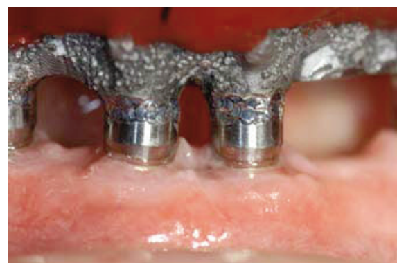
Figure 2 Framework passivated using Cresco system.