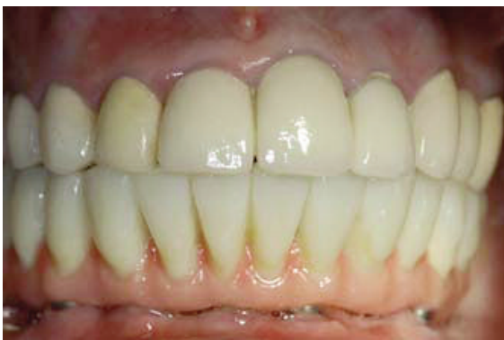
Figure 4 3-year follow-up.

with new preformed titanium cylinders that fit onto the implant replicas. The coupling of the framework to the prefabricated machined cylinders was made with a precise automatic computer driven machine. Patients were recalled for oral hygiene sessions every 3 months after treatment completion.