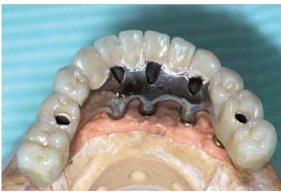
Figure 3 Final restoration.