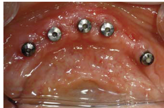
Figure 1 Impression phase.

After making the final impressions on the abutments, casts were made and then, in the test group the framework was made using the Cresco system while in the control group a traditional lost-wax technique was performed to produce a screw-retained bridge. All steps for the test group prostheses were performed according to the described Cresco protocol (16) (Figs. 1-4), and followed by implant connection obtained with preformed, bendable burn-out acrylic tubes that allowed screw retention of the framework directly to the implant (without abutment). After a one-piece wax framework was prepared, the waxed framework was sent to the Cresco Ti milling centre, together with the master cast. The marginal portion of the cast tubes connecting the framework with the implants was then cut and substituted by means of laser welding